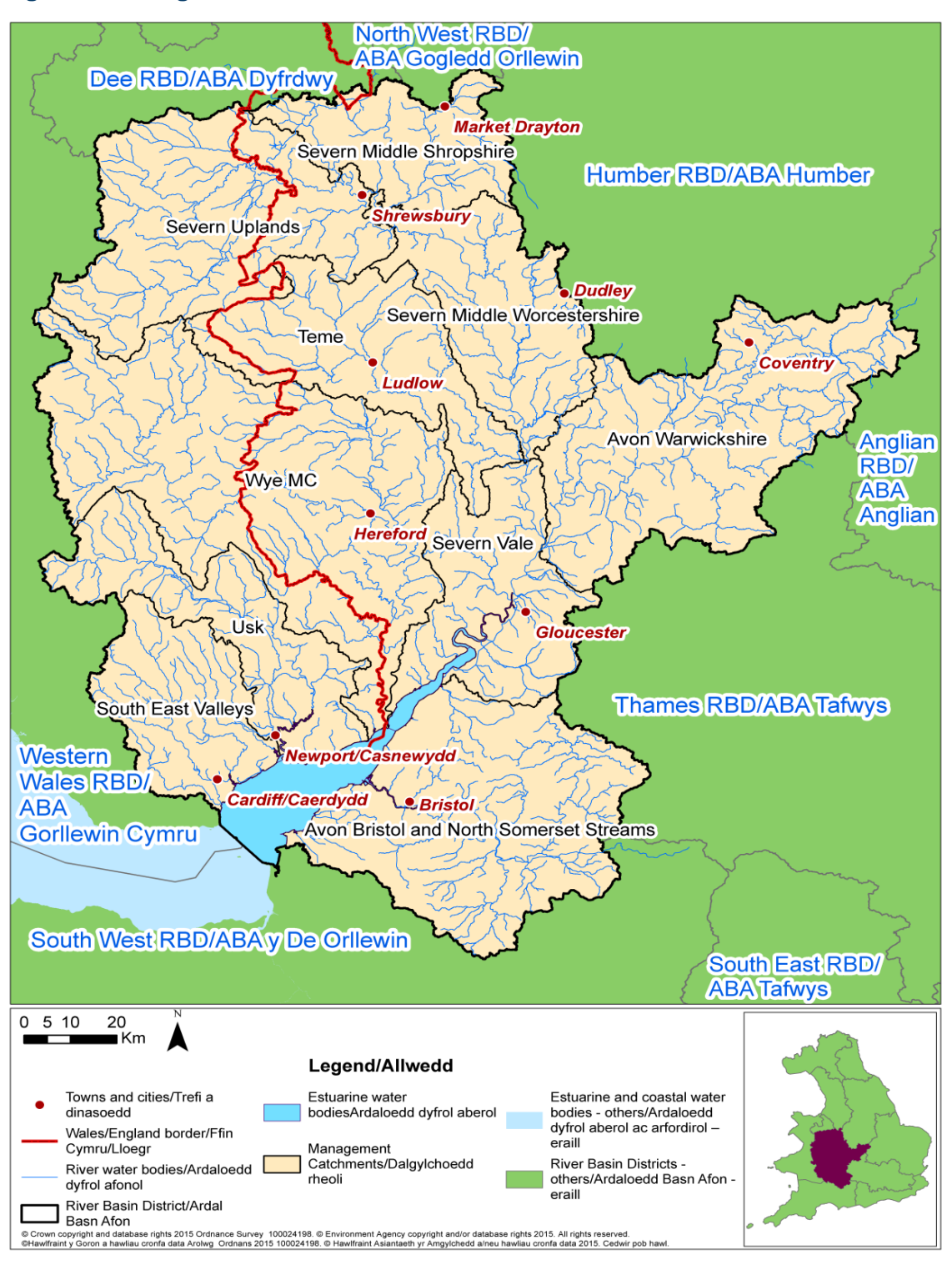
Figure 2: Management catchments within the Severn river basin district

Taking a catchment based approach helps to bridge the gap between strategic management planning at river basin district level and activity at the local water body scale. A catchment based approach aims to encourage groups to work together more effectively to deal with environmental problems locally. Most catchment groups operate at the water 'management' catchment scale. Figure 2 shows the management catchments in the river basin district.