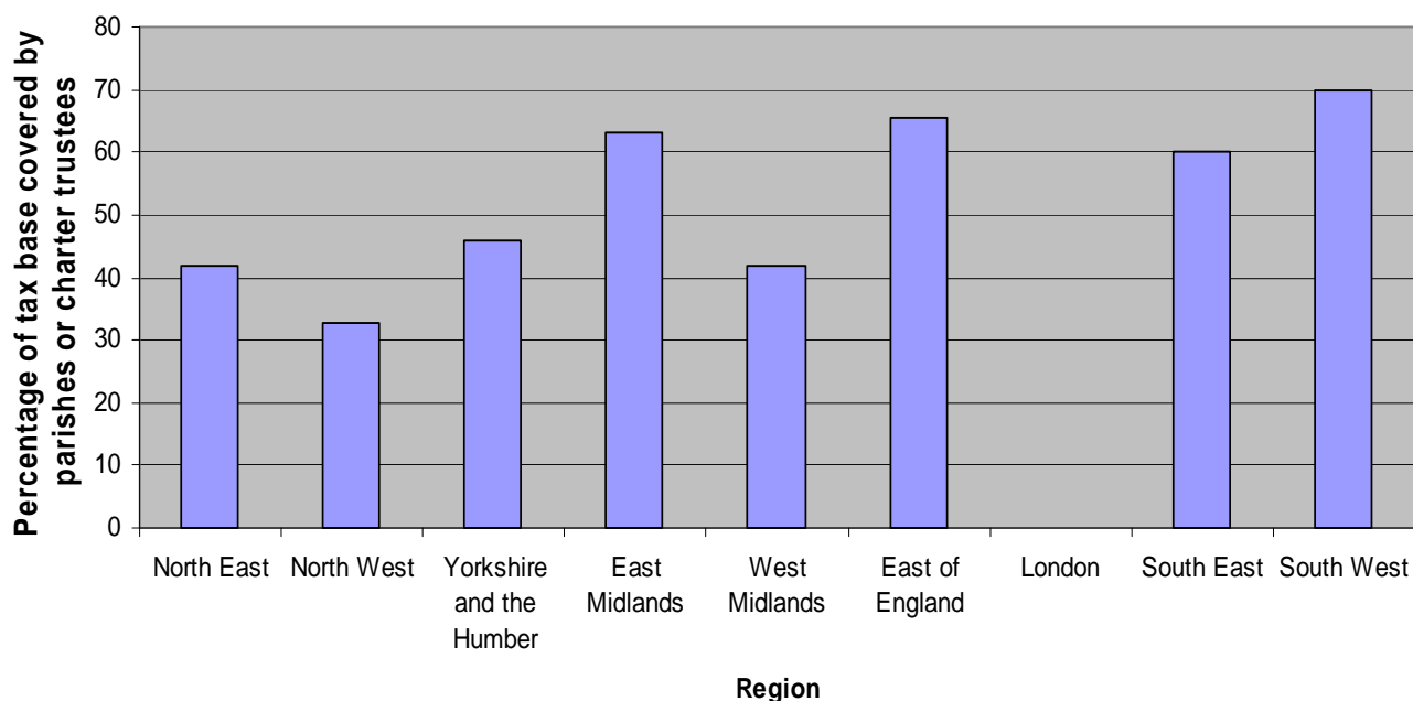
Chart A: Tax base of local precepting authorities, by region, as a percentage of the total regional tax base 2011-12