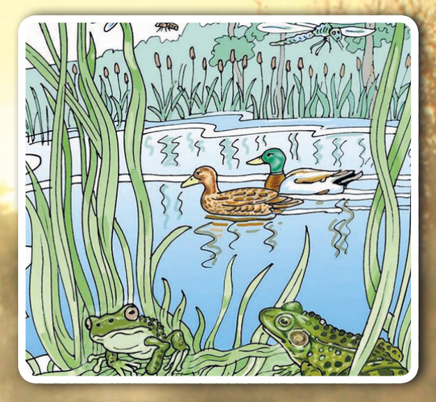
A New Home