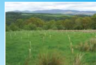
Crairieknowe, Auchenhessnane and Holm of Drumlanrig.

'For us, the income stream has enabled developments and improvements to the estate's natural assets, and the projects sustain local employment.'