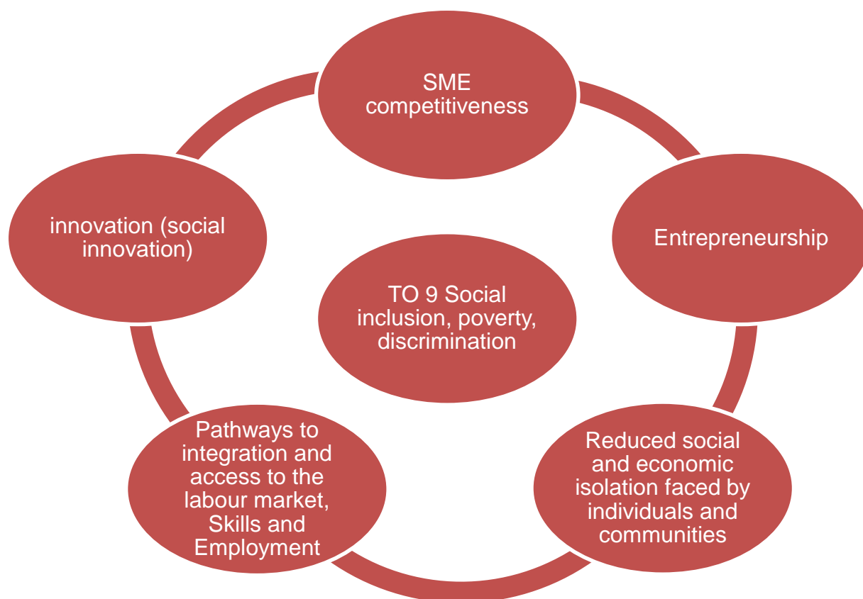
Figure 2: Policy priorities for Community Led Local Development