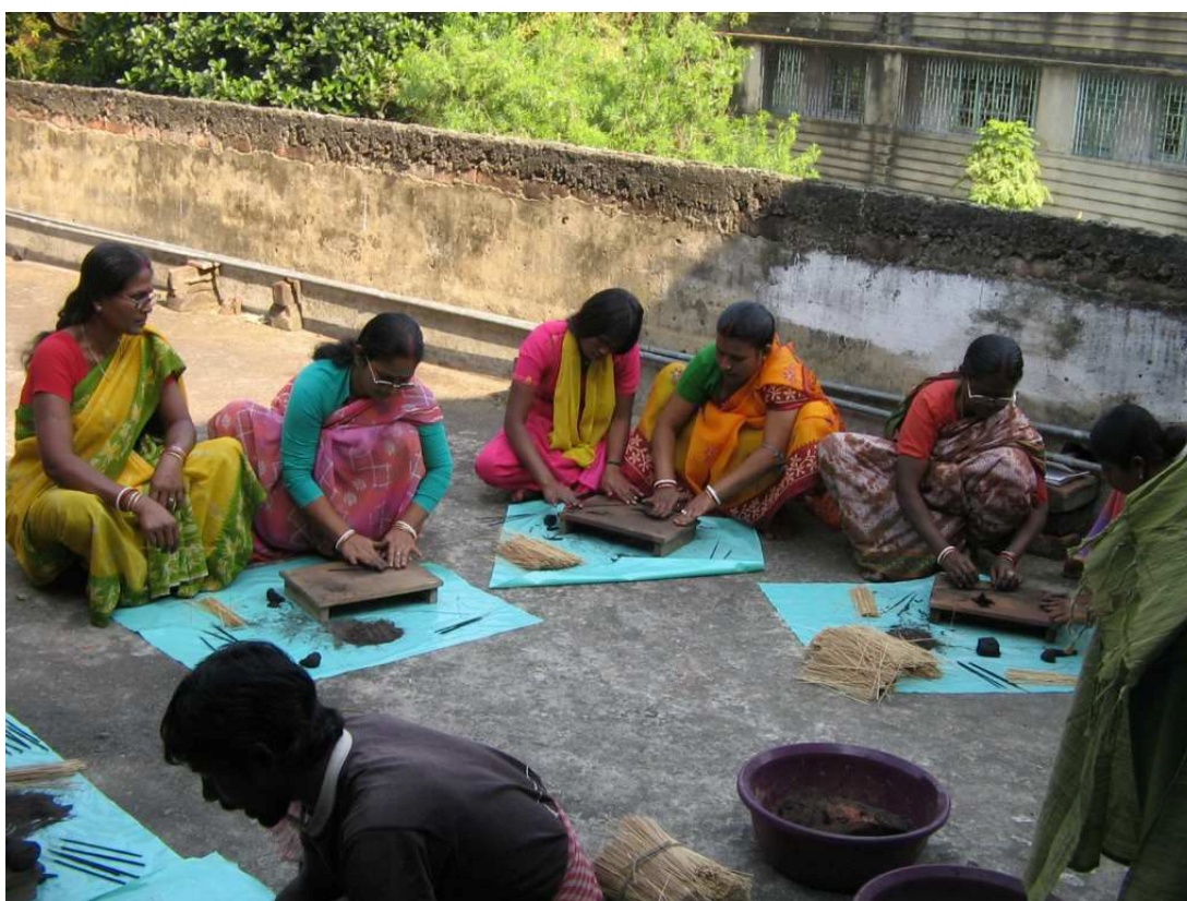
Kolkata Urban Services Programme

5.5 Nonetheless, as stated in Paragraph 4.68 DFID did seek to strengthen harmonisation by co-financing KEIP together with ADB, the only other donor in the urban sector in West Bengal. DFID has also been working to harmonise with the World Bank in the health sector, the Bank's investment is to be aligned with HSDI.