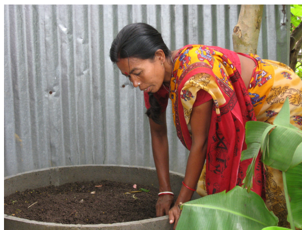
Kolkata Urban Services Programme

4.28. The way in which operations and maintenance (O&M) has been costed (i.e. excluding salaries and wages in KUSP), and the fact that the cost of O&M and further capacity building is not built into post-KEIP calculations raise concerns over sustainability. The municipalities must be prepared to spend in these areas once the programmes end.