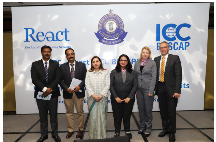
The Central Board of Customs and Excise and React

Further information can be found in this BASCAP press release .