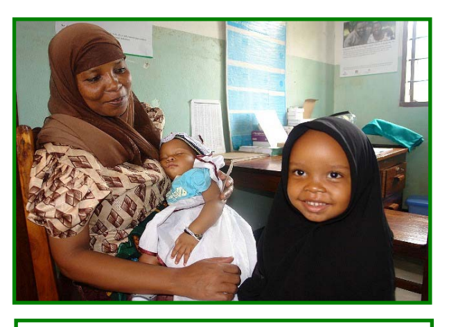
A mother and her two children wait to see the doctor at a health clinic in the capital Dar es Salaam. Through direct support to the Government of Tanzania UKaid has been helping to improve people's access to health care, especially for women and children.

DFID will provide support and technical expertise in key areas such as public financial management to help the Government of Tanzania implement its poverty reduction strategy. We will continue to work closely with the Tanzanian Government, but will also work more with civil society and the private sector, in line with recommendations from the 2010 evaluation of our country programme.