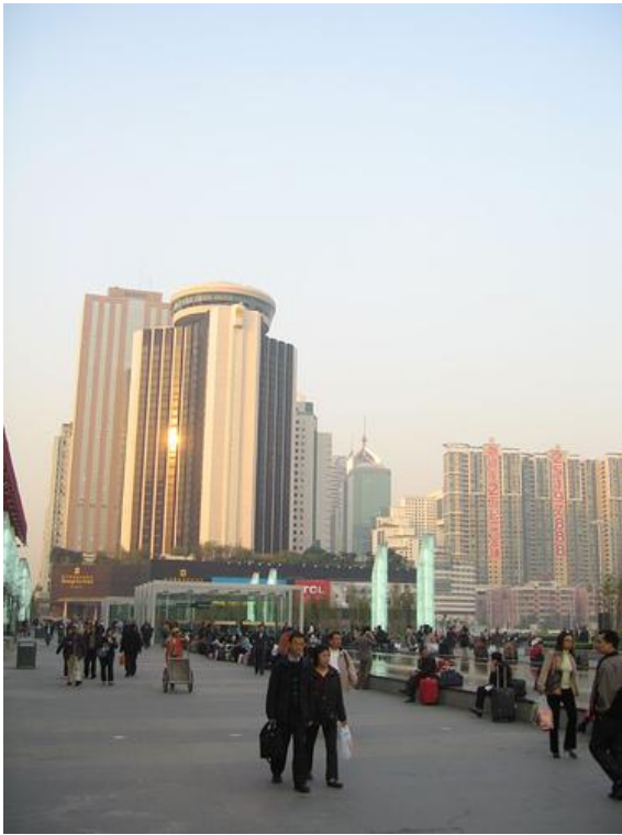
Shenzhen, China

We are committed to creating new partnerships with the private sector to increase green investments. The aim is to demonstrate to private sector investors that climate friendly investments in developing countries are financially viable. Examples of UK support include: