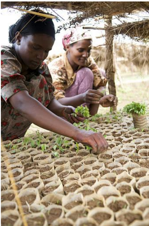
Workers at a plant nursery in Ethiopia

The UK is supporting a number of research initiatives through Fast Start finance, including: