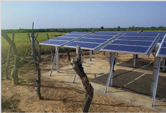
World Mali Solar Power Project.

The UK has provided £3.3 million of Fast Start finance to the REACT programme.