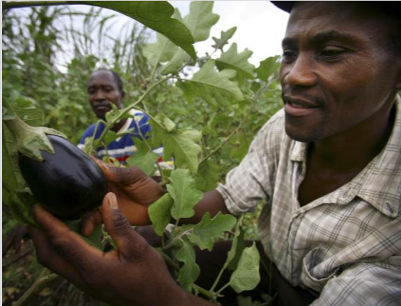
Aubergines in a farmers garden in Cap Rouge, Haiti