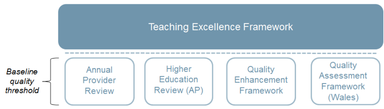
Figure 1: Relationship between quality assessment and the TEF