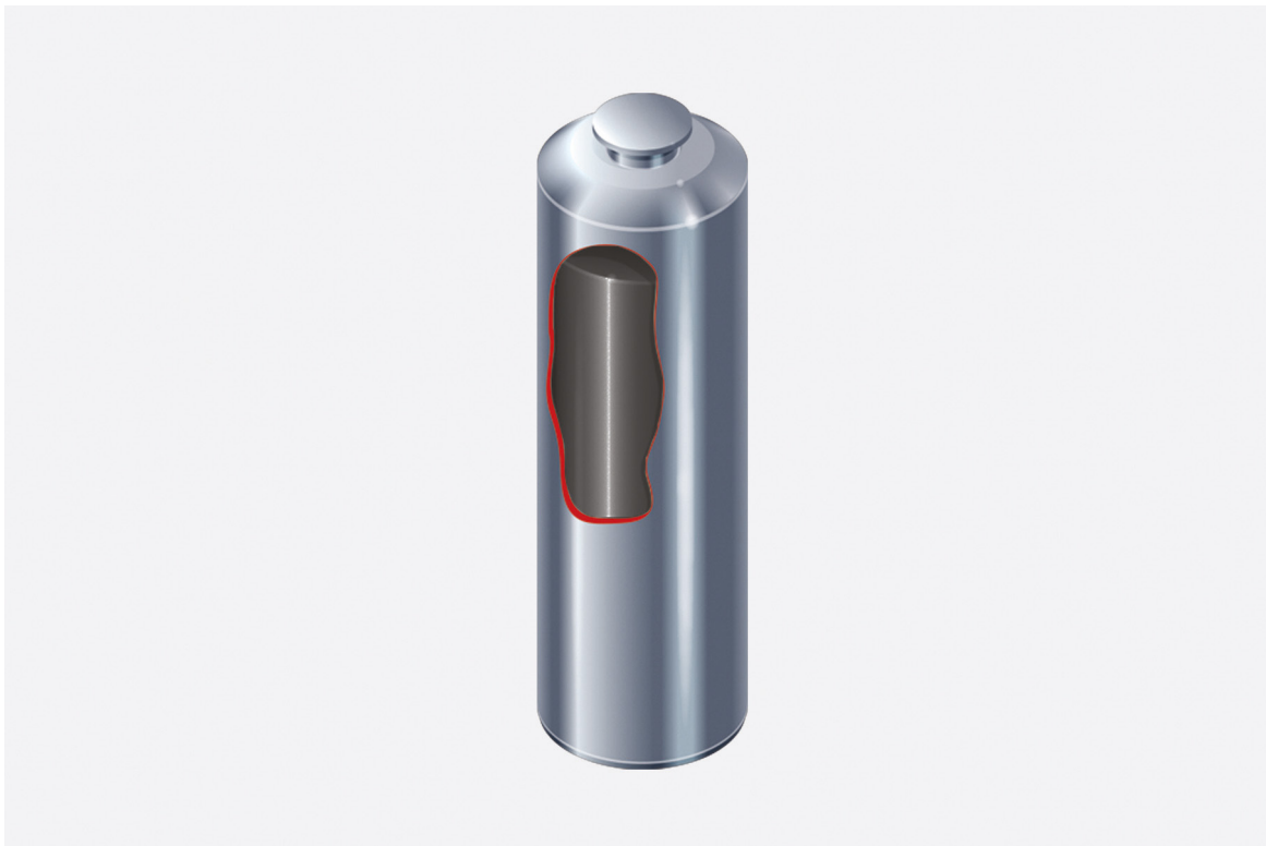
Figure 1: Stainless steel canister containing vitrified High Level Waste.

High Level Waste (HLW) – this comes from the reprocessing of spent fuel used in nuclear reactors. This liquid waste is made into a solid glass in a process called “vitrification”. HLW generates a lot of heat, and this needs to be factored into GDF design.