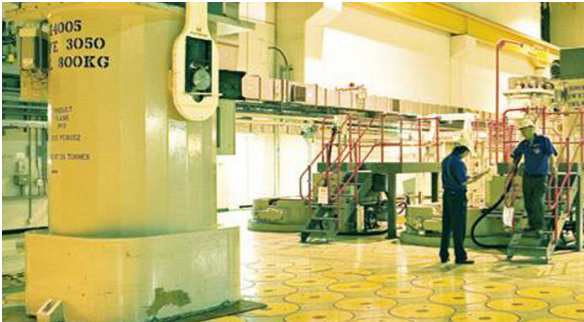
Figure 2: High Level Waste store at Sellafield.

Intermediate Level Waste (ILW) – which comes from the operation and decommissioning of nuclear power plants and other nuclear facilities. Any liquid ILW is converted to a solid by mixing it into materials such as cement. You can see what a package of ILW mixed with cement looks like on the front cover of this document.