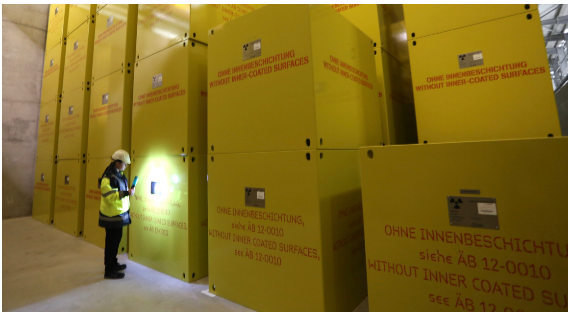
Figure 3: Intermediate Level Waste store at Berkeley.

Intermediate Level Waste (ILW) – which comes from the operation and decommissioning of nuclear power plants and other nuclear facilities. Any liquid ILW is converted to a solid by mixing it into materials such as cement. You can see what a package of ILW mixed with cement looks like on the front cover of this document.