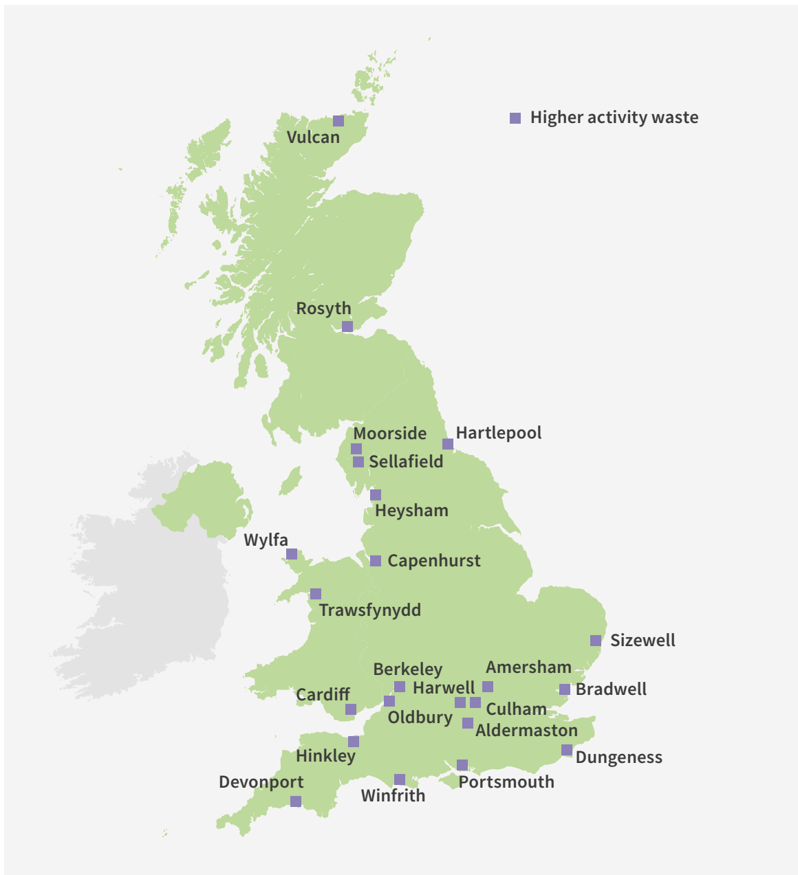
Figure 4: Sites where higher activity waste destined for a GDF is currently stored.

Higher activity radioactive waste destined for a GDF already exists and is currently being stored at over 20 nuclear sites around the UK.