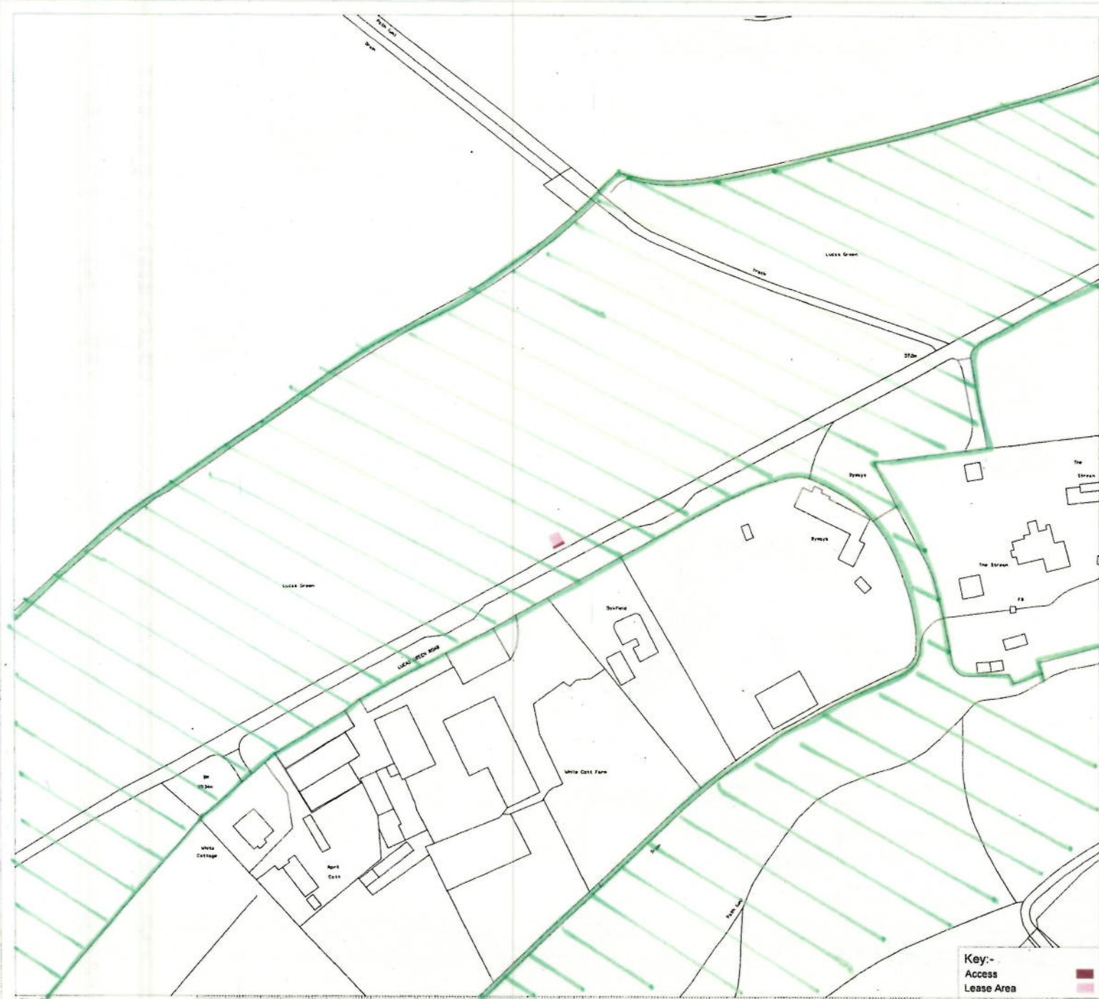
Site Plan 1:1250