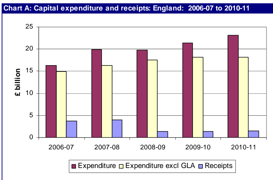
Table 1: Local authority capital expenditure and receipts: England: 2006-07 to 2010-11