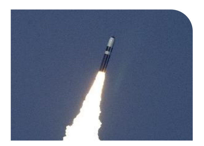
Trident D5 missile