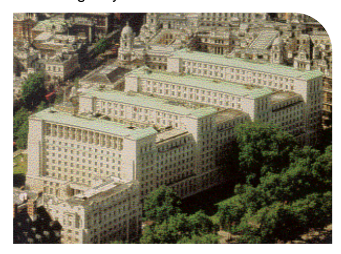
Ministry of Defence Head Office

5.10 Command of the IRF and FoF in the event of a DNM transport emergency rests with the Chief of Defence Staff (CDS) in London. The MCA is the appointed qualified and experienced Executive Director of the MOD's operational response in the incident area. The MCA keeps HQ DNEO informed on the status of the emergency and of the operational response to it. A secretariat cell in MOD HQ DNEO will provide advice to Ministers and the defence press office on the response as appropriate to the scale of the emergency.