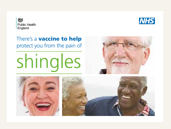
Shingles postcard: in stock and ready to order Product code: 2942856C See weblink 16