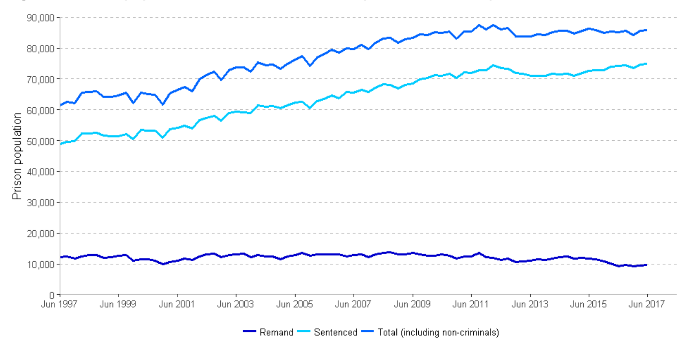
Figure 1: Prison population, 30 June 1997 to 2017

The sentenced prison population stood at 74,803 (87%); the remand prison population stood at 9,638 (11%) and the non-criminal prison population stood at 1,422 (2%).