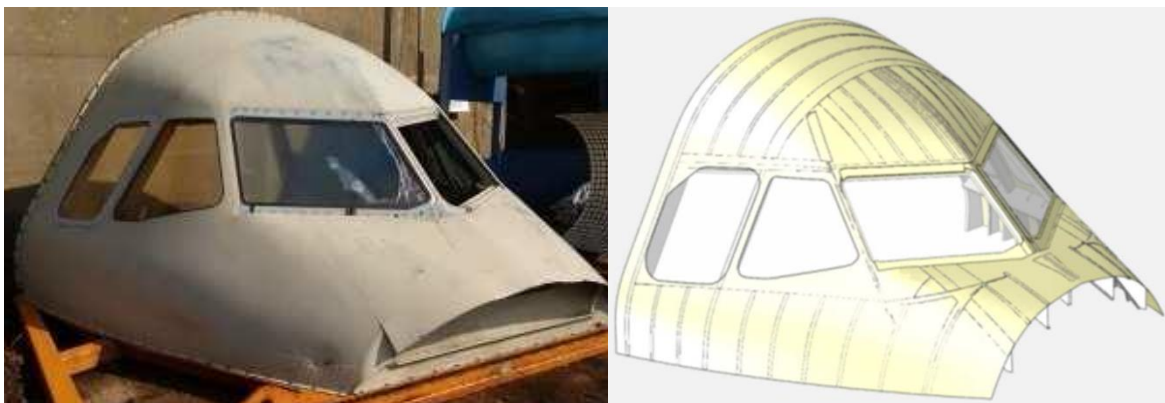
Figure 1: Airliner cockpit for impact testing (left) and computer reference model