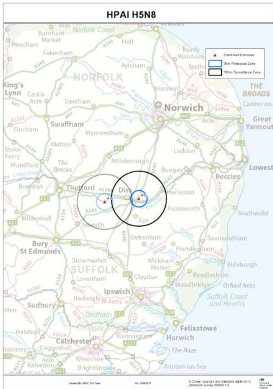
Figure 2: Map showing the location of IP 13 in relation to IP 9, together with the associated PZs and SZs.