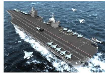
Artist's impression of Carrier Strike

We will plan concurrently to operate a mix of helicopters as well as Joint Strike Fighters from the carrier. This will include up to 12 Chinook or Merlin transport helicopters and eight Apache attack helicopters. The precise mix will depend on the mission.