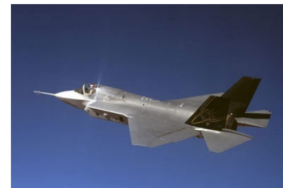
Joint Strike Fighter