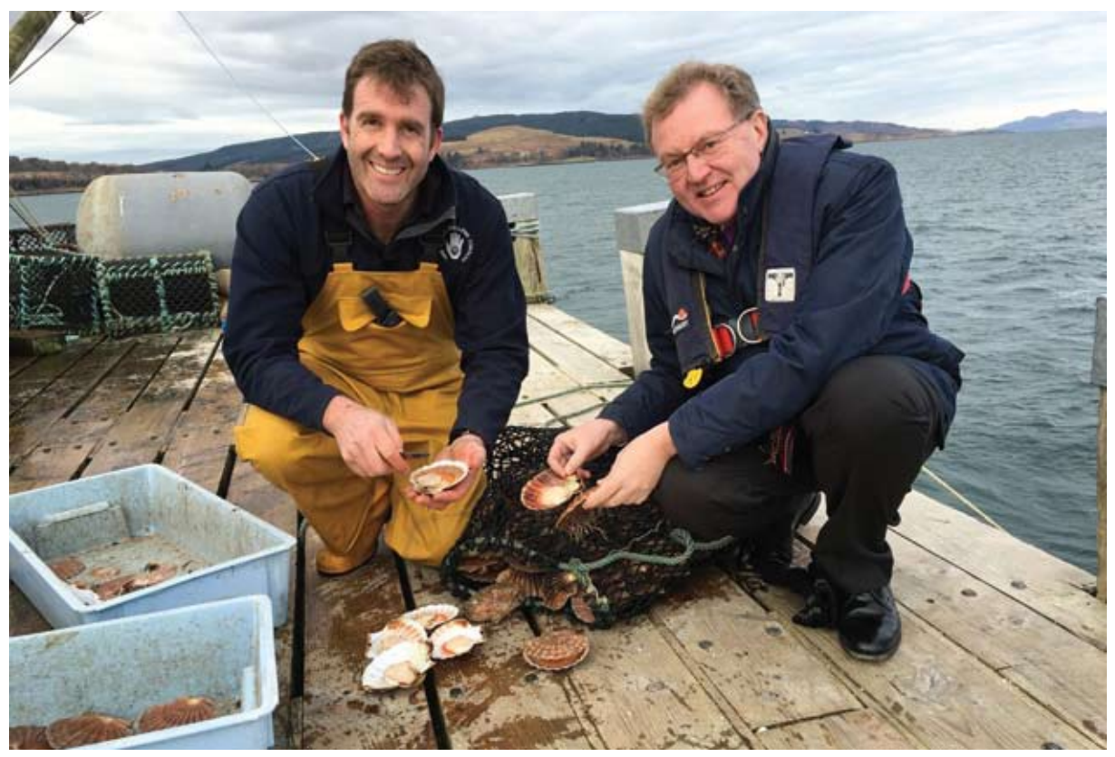
The Secretary of State on a visit to the Ethical Shellfish Company on the Isle of Mull