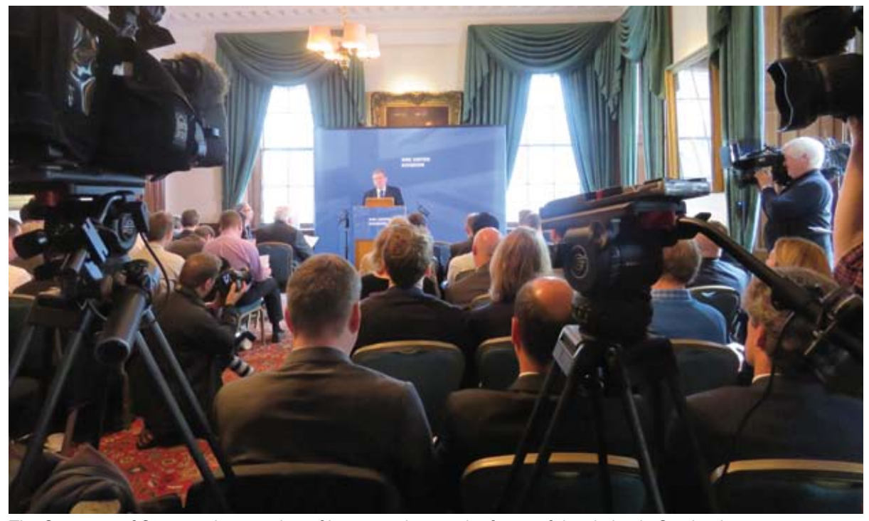
The Secretary of State made a number of key speeches on the future of devolution in Scotland

Over the past year, the Scotland Office has sought to engage and inform the public about the new powers in the Scotland Act 2016 through a programme of Ministerial speeches, campaigns and digital content, newspaper and television interviews, online information, social media and printed materials, stakeholder programmes, Ministerial visits, local authority engagement and attendance at public events.