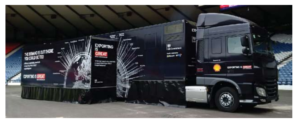
The Exporting is GREAT roadshow came to Edinburgh, Glasgow, Dundee and Aberdeen early in 2016

Practical examples of the collaborative approach being taken include UKTI's and SDI's delivery of the annual Explore Export event in Edinburgh on 6 November 2015, attended by over 150 businesses. Close partnership working between the Scotland Office, UKTI, Scottish Enterprise and the Scottish Council for Development and Industry was also essential to support the Exporting is GREAT roadshow launched in Glasgow on 29