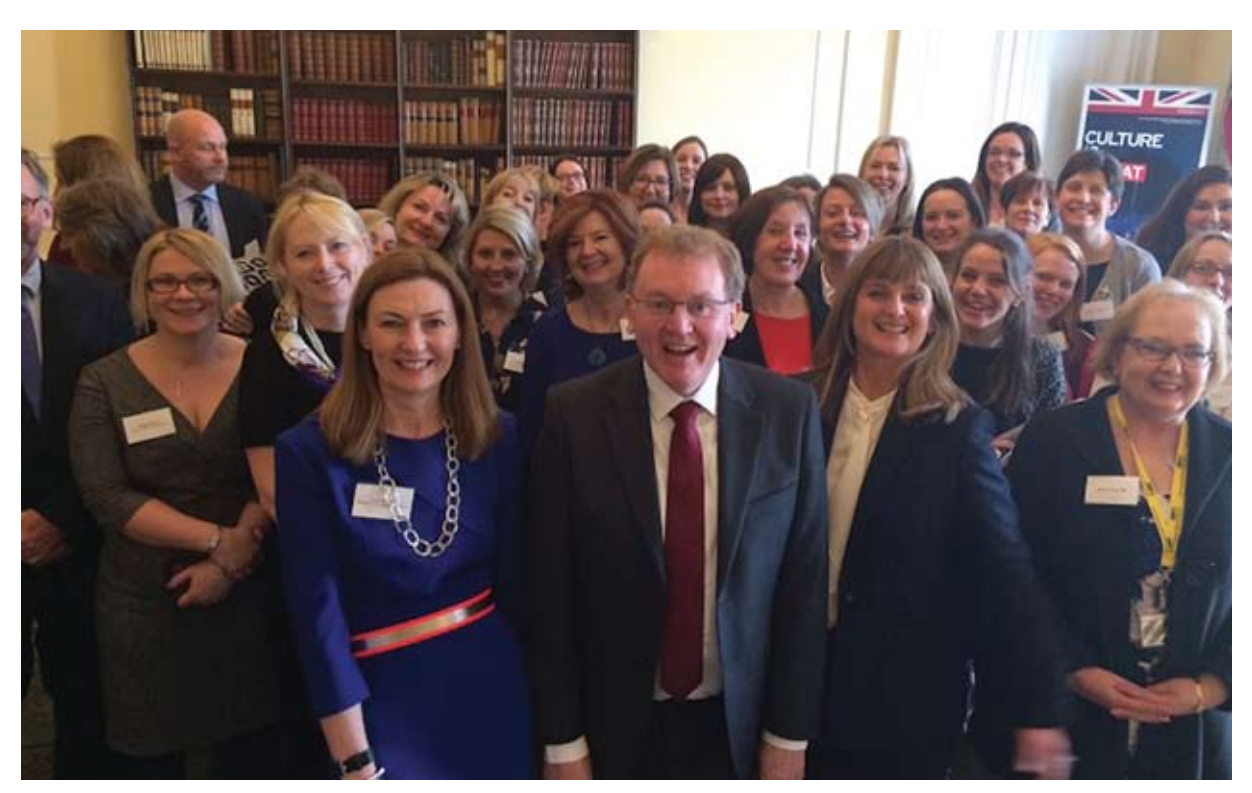
The Scotland Office hosted a reception to mark International Women's Day