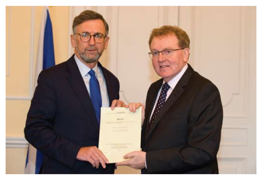
The Secretary Of State and Scotland Office Minister with the Scotland Act 2016

In September 2014 the people of Scotland voted in a referendum to remain part of the United Kingdom. Following the referendum, the Prime Minister asked Lord Smith of Kelvin to convene all five of Scotland's main political parties and reach a consensus on which additional powers should be devolved in order to improve the devolution settlement. The Smith Commission Agreement was published on 27 November 2014 and recommended a significant package of new powers for the Scottish Parliament.