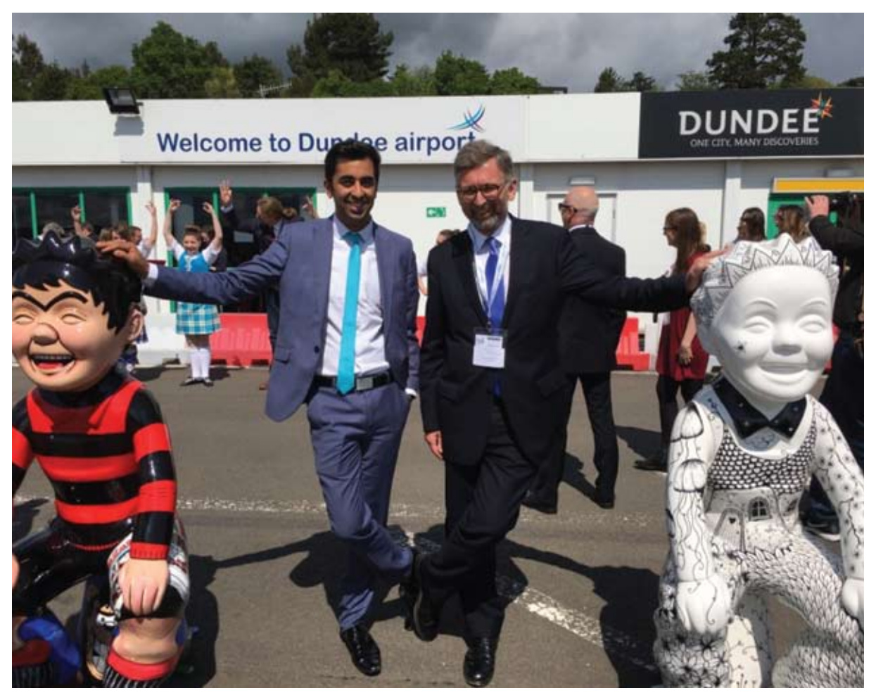
The UK Government also helped support a new Dundee - Amsterdam air link

Scottish flights support: air links between Dundee and London were secured for a further six months with the UK Government, the Scottish Government and Dundee City Council agreeing to extend the current public service obligation contract until the end of 2016. This created the chance for a longer term solution for this important connection for Dundee.