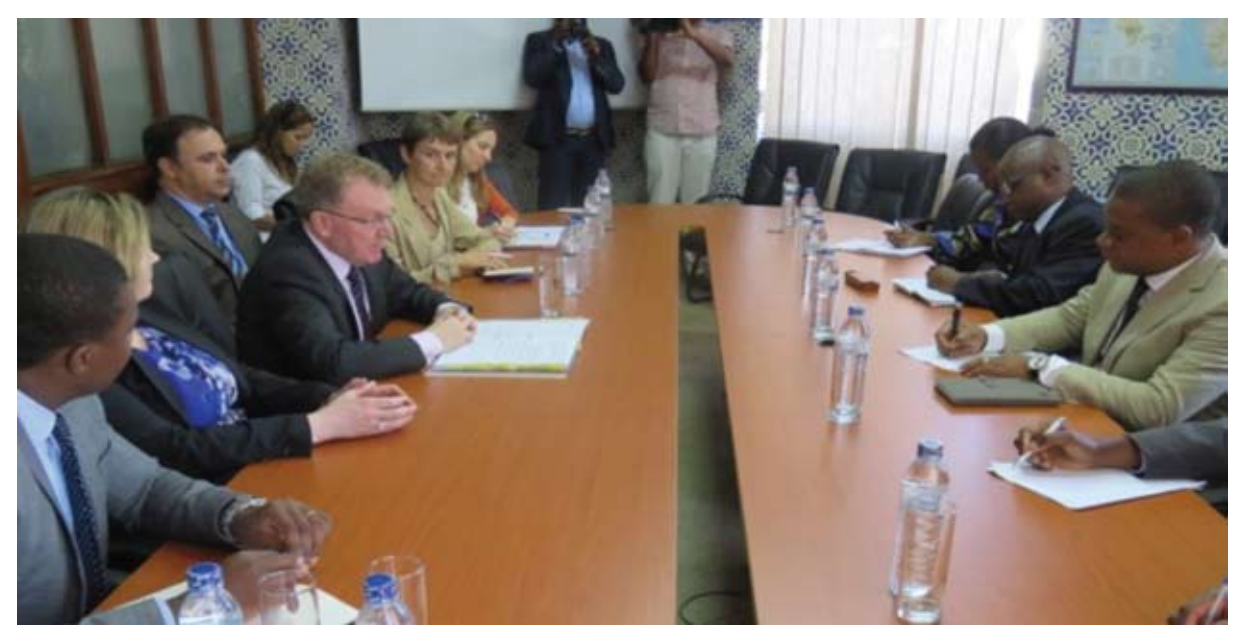
The Secretary of State promoting Scotch whisky exports at a meeting with Malawi's Trade Minister in February 2016

Scotch whisky protection in Mozambique: following the Secretary of State for Scotland's visit to Mozambique (February 2016) and his meeting with the Minister of Industry and Commerce, State officials confirmed Scotch whisky as a Geographical Indication. Described as a "legal breakthrough" by the Scotch Whisky Association, the protection will help Scottish distillers maximise the value of this important new market.