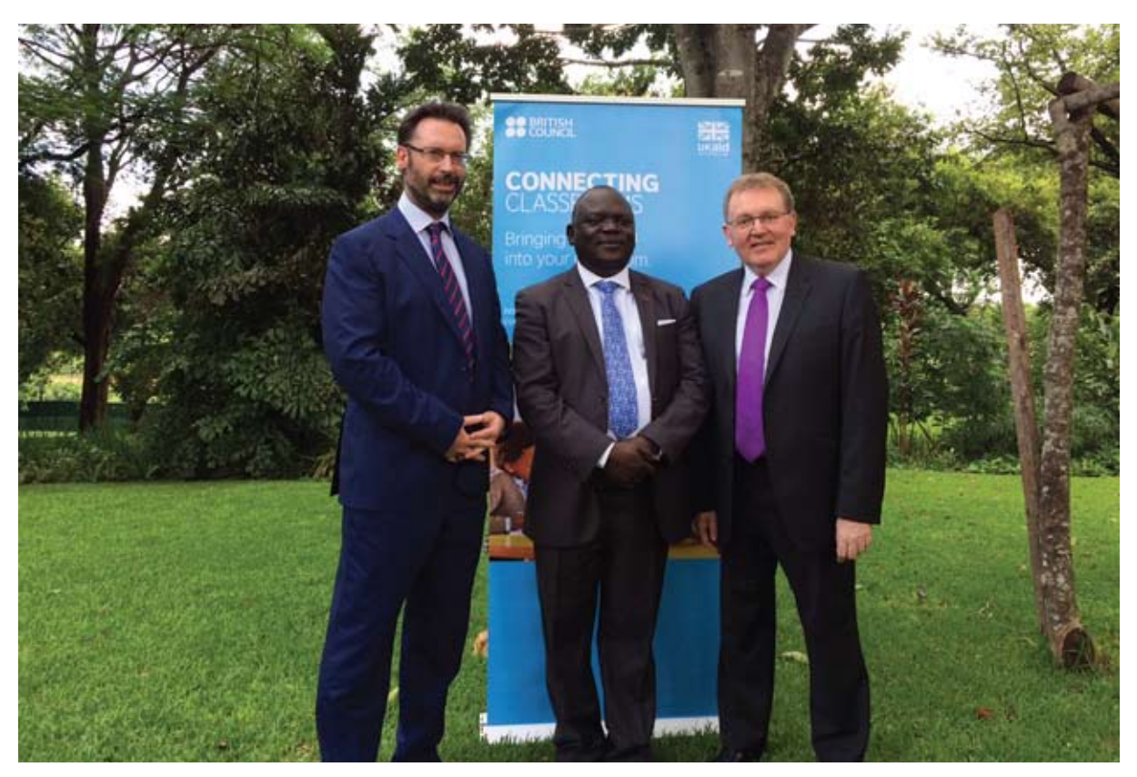
The Secretary of State on a visit to Malawi

The Secretary of State has also undertaken a highly successful international visit to Mozambique and Malawi which linked in with the work from the UK Government and Aberdeen City Council on oil and gas and the UK Government work on international aid. A ministerial visit to Texas to further support the North Sea sector took place in June.