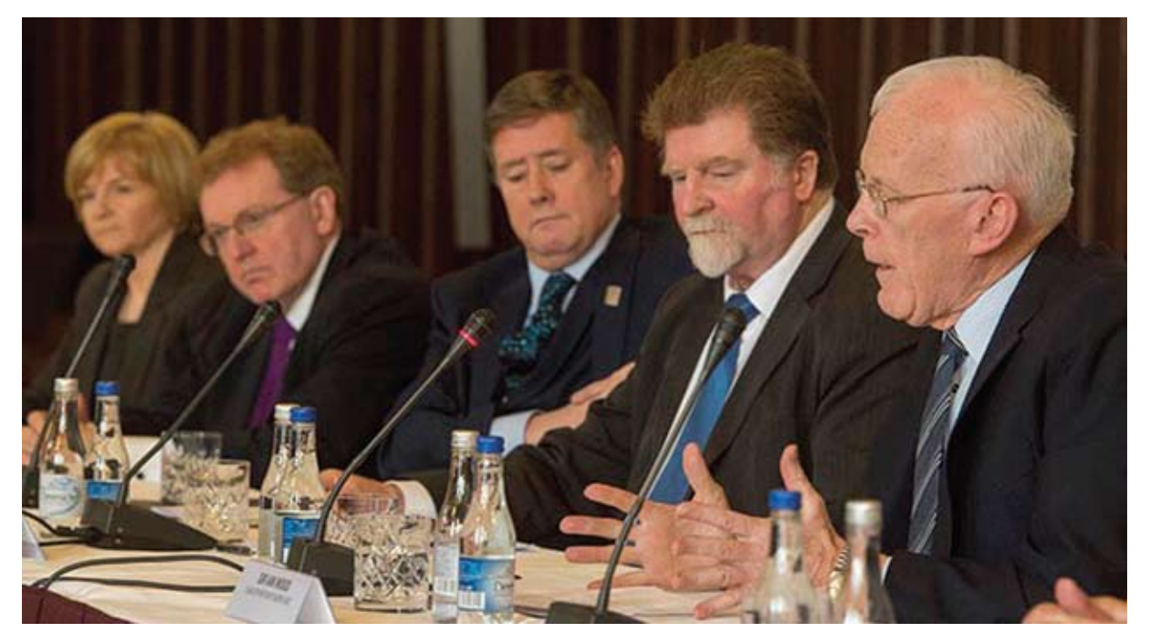
The Secretary of State at the signing of the Aberdeen City Region Deal

Building on the success of the Glasgow and the Clyde Valley City Region Deal, the Scotland Office has played a central role in the development of further Scottish City Region Deals in 2015-16. This includes the Aberdeen City Region Deal, announced on the 28 January 2016 and the Inverness City Region Deal, announced on the 22 March 2016. The Chancellor of the Exchequer also announced the UK Government's intention to formally commence negotiations with all partners engaged in the proposals for an Edinburgh and South East Scotland City Region Deal in his 16 March 2016 Budget.