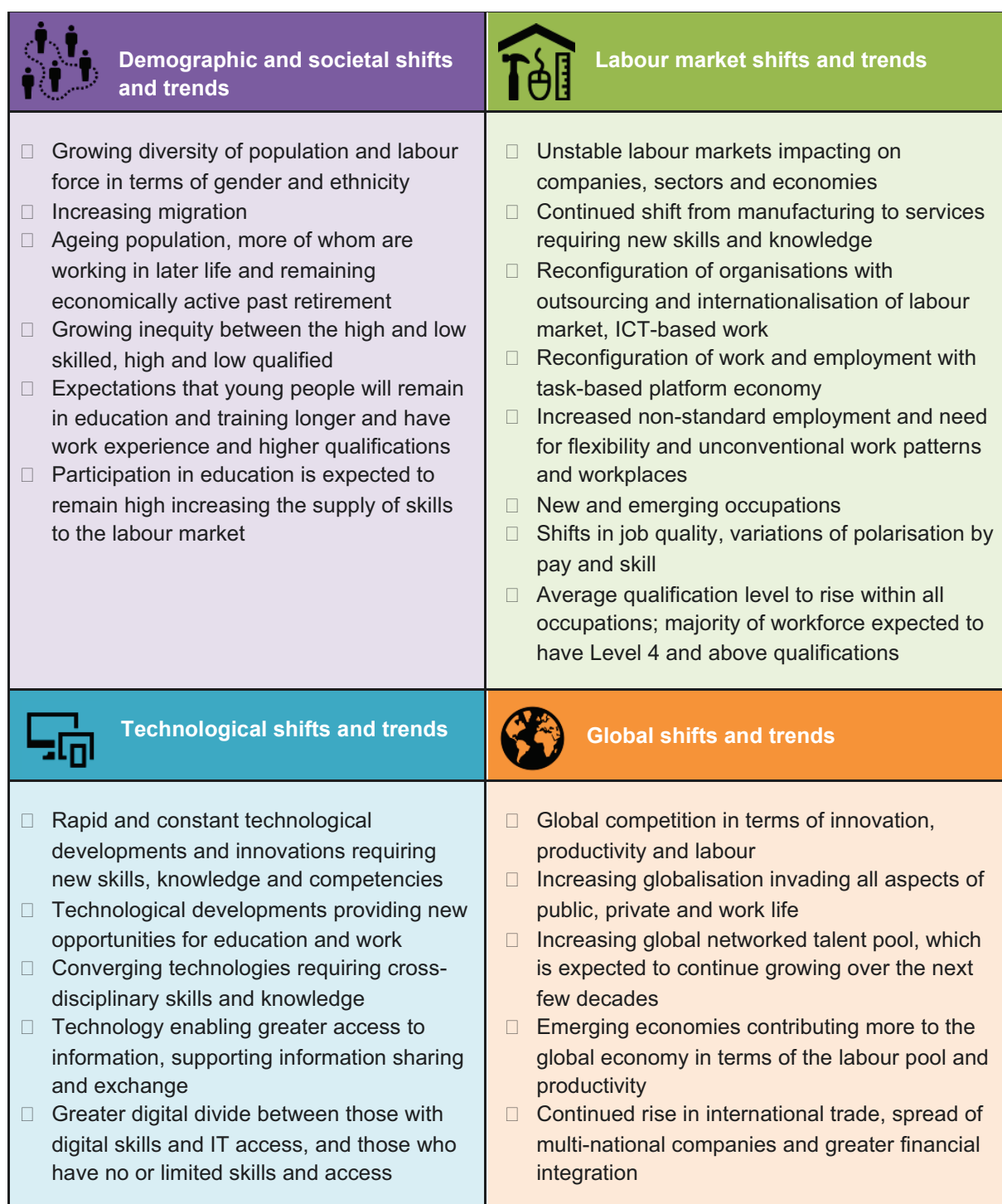
Table 1 Overview of demographic and labour market shifts

Sources: de Hoyos et al., 2013; Eurofound, 2015; Huws, 2015; OECD, 2016a; OECD, 2016c; OECD, 2015b; Paccagnella, 2016; Störmer et al., 2014; UKCES, 2016; Warhurst et al., 2016; Wilson et al., 2016