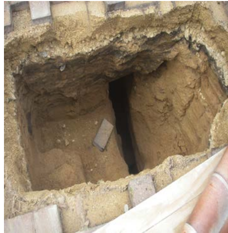
Coal mining related fissures