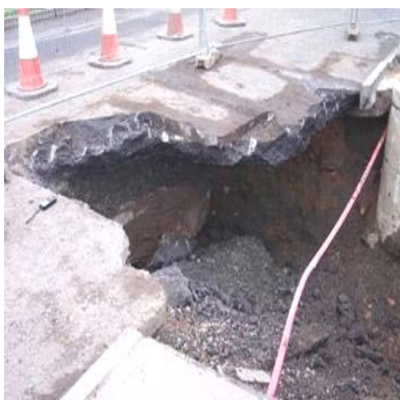
The collapse of shallow coal mining workings