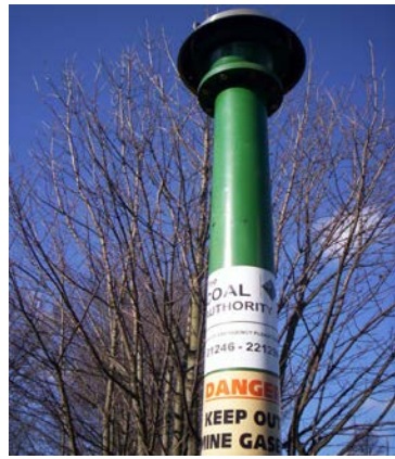
Mine gas vents