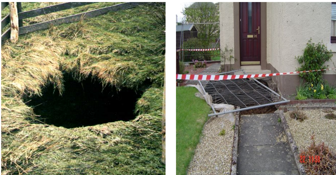
Mine entries: open countryside and within existing developed areas

Mine entries have the potential to collapse causing potential land instability, but there is a further risk that mine entries provide a potential pathway to the surface for mine gases and mine water.