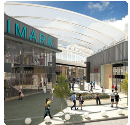
■ Stafford Riverside development – artist impression.

Crewe is an important location on the existing rail network and will provide wider important connectivity to the HS2 network. HS2 trains will also serve the current station in Stafford. This will become an 'integrated high speed station', where passengers can catch HS2 trains and access the high speed network to the south. HS2 Ltd is undertaking detailed work on an option for HS2 trains to serve Stoke-on-Trent and Macclesfield and we will keep the Councils concerned informed as this work develops.