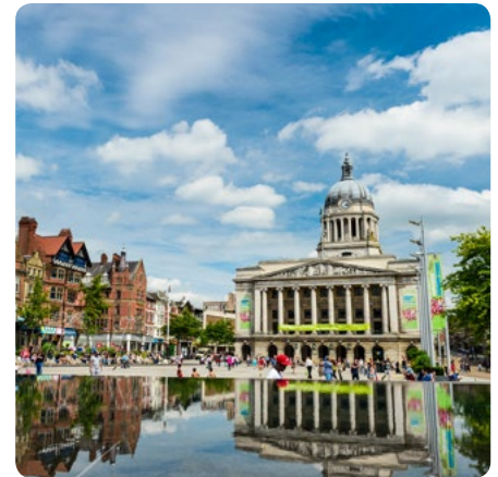
■ Market Square House, Nottingham

Derby and Nottingham are working together on an ambition that envisages a journey time of just 10 minutes from their city centres to the HS2 hub, as well as better links the two cities in the process.