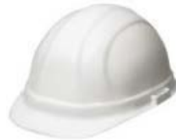
White – General Use (Including sites where colour coding impractical), Manager, Client (Highways England), Competent Operative