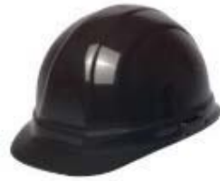
Black Site Supervisors

https://www.gov.uk/government/publications/health-and-safety-for-major-road-schemes-safety-helmet-colours