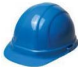
Blue – Inexperienced Person / Visitor