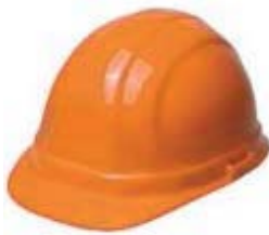
Orange Slinger / Signaller