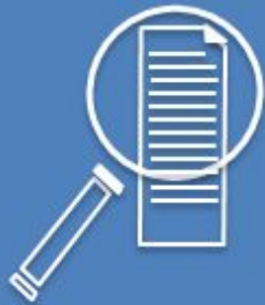
Search and Long List