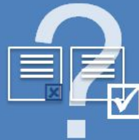
Evaluation and Selection