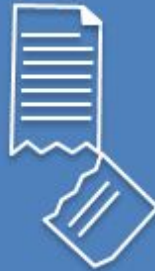
Long List to Short List