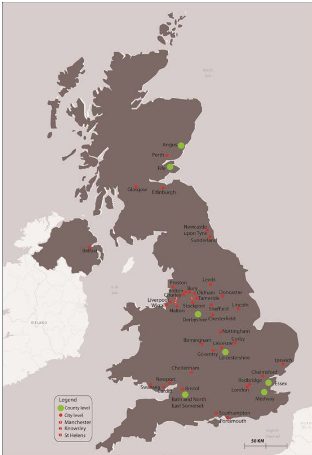
Figure 4: An overview of British Cities with Chinese twinning relations

In comparison, a sizeable share of British cities is located in England where, especially Northern English cities such as Manchester and Liverpool with a strong industrial heritage have many twinning relations with Chinese cities (See figures 4 and 5).