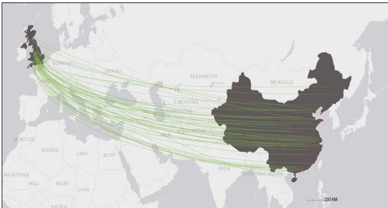
Figure 1: Mapping Sino-British twinning relations

Since the 1980s, 52 formal twinning relations were formed between British and Chinese cities (see Annex 1), whereby a large share of twinned Chinese cities is located along the coastal area (see figure 1 and 2). Especially cities in the economically advanced regions of the Pearl River Delta and the Yangtze River Delta such as Guangzhou, Shanghai, Taicang and Zhuhai have created twinning relations with British cities in the past thirty years (see figure 3).