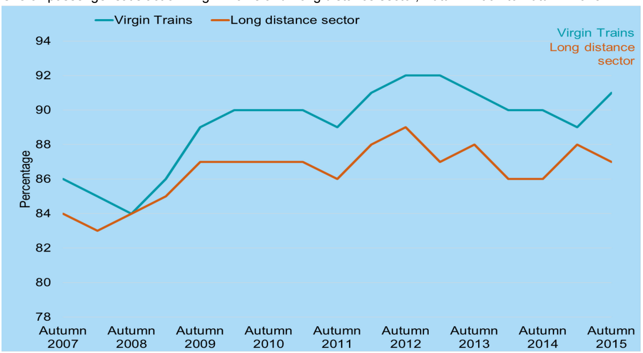
Figure 2.3 National Rail Passenger Survey (NRPS)

Overall passenger satisfaction Virgin Trains and Long distance sector, Autumn 2007 to Autumn 2015