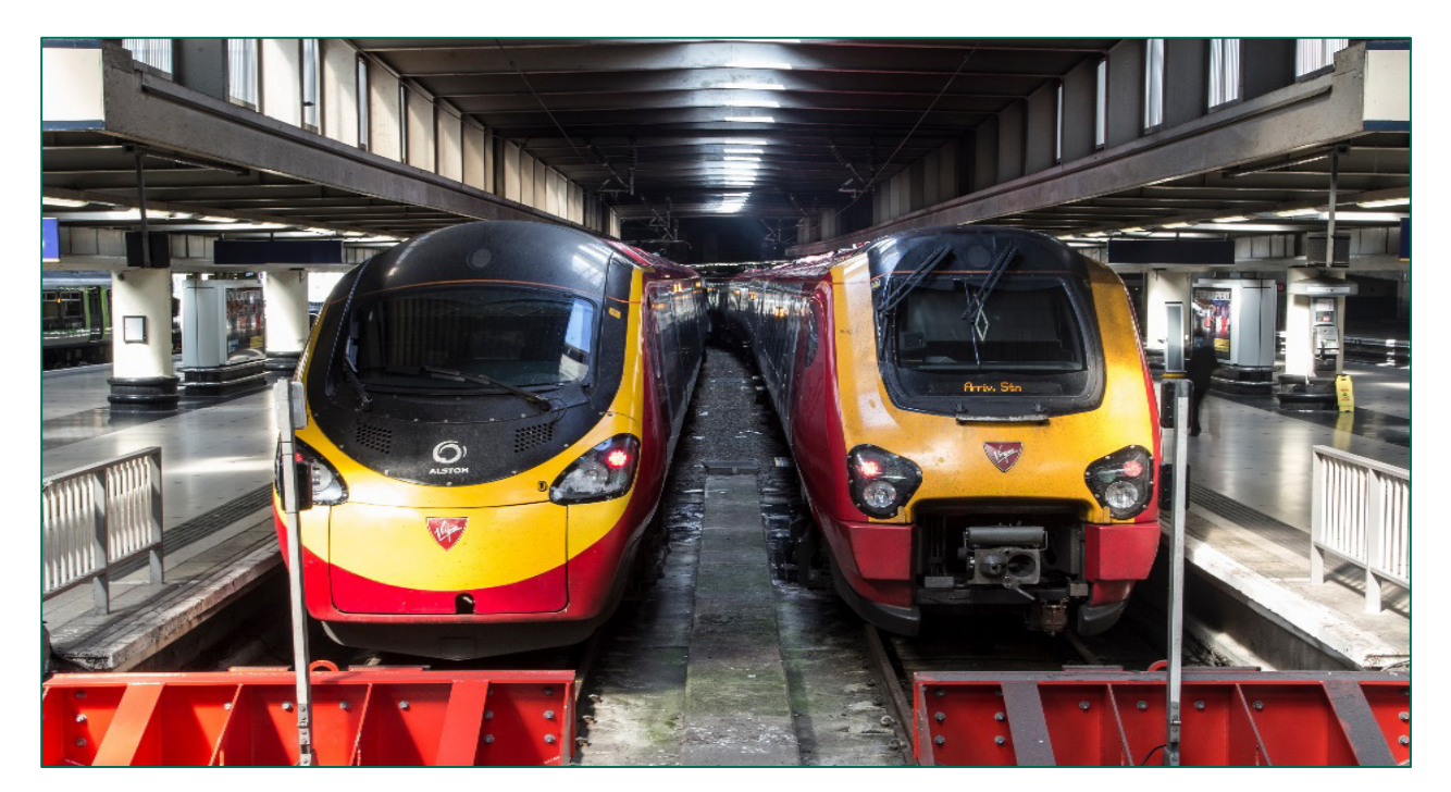
Figure 2.2 Pendolino on the left and Super Voyager on the right

2.8 Currently train services are provided by 56 electric Pendolino and 20 diesel-electric Super Voyagers (Fig 2.2). In 2012, 106 extra Pendolino carriages were added to the fleet in 2012. By September 2015 35 of the 9 carriage trains were extended to 11 carriage trains, increasing the number of standard class seats by 150 on each extended train. In May 2015 work was completed on Pendolinos improving Wi-Fi speeds by around four times faster (a year ahead of schedule).