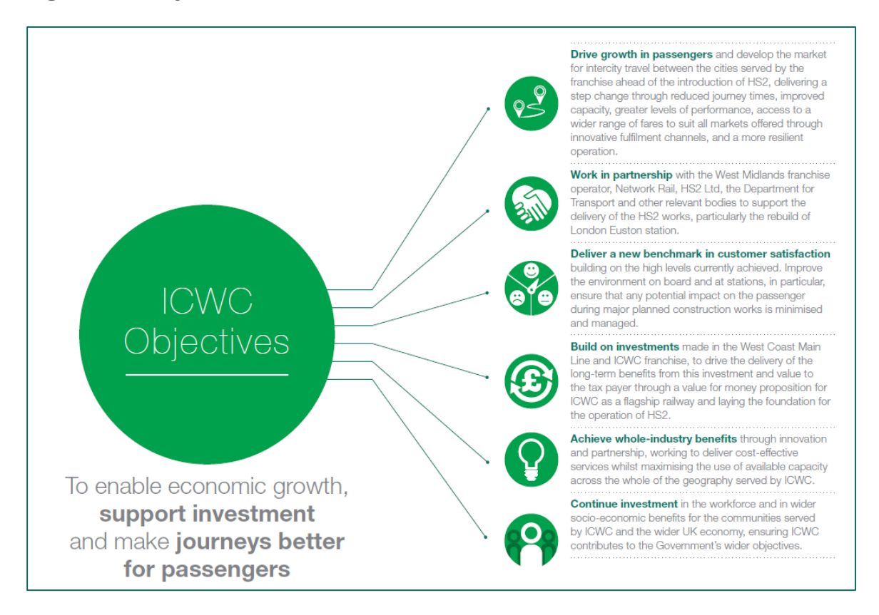
Figure 1.1 Objectives<sup>4</sup> for the new ICWC franchise

<sup>4</sup> ICWC Objectives from Overview and Vision document