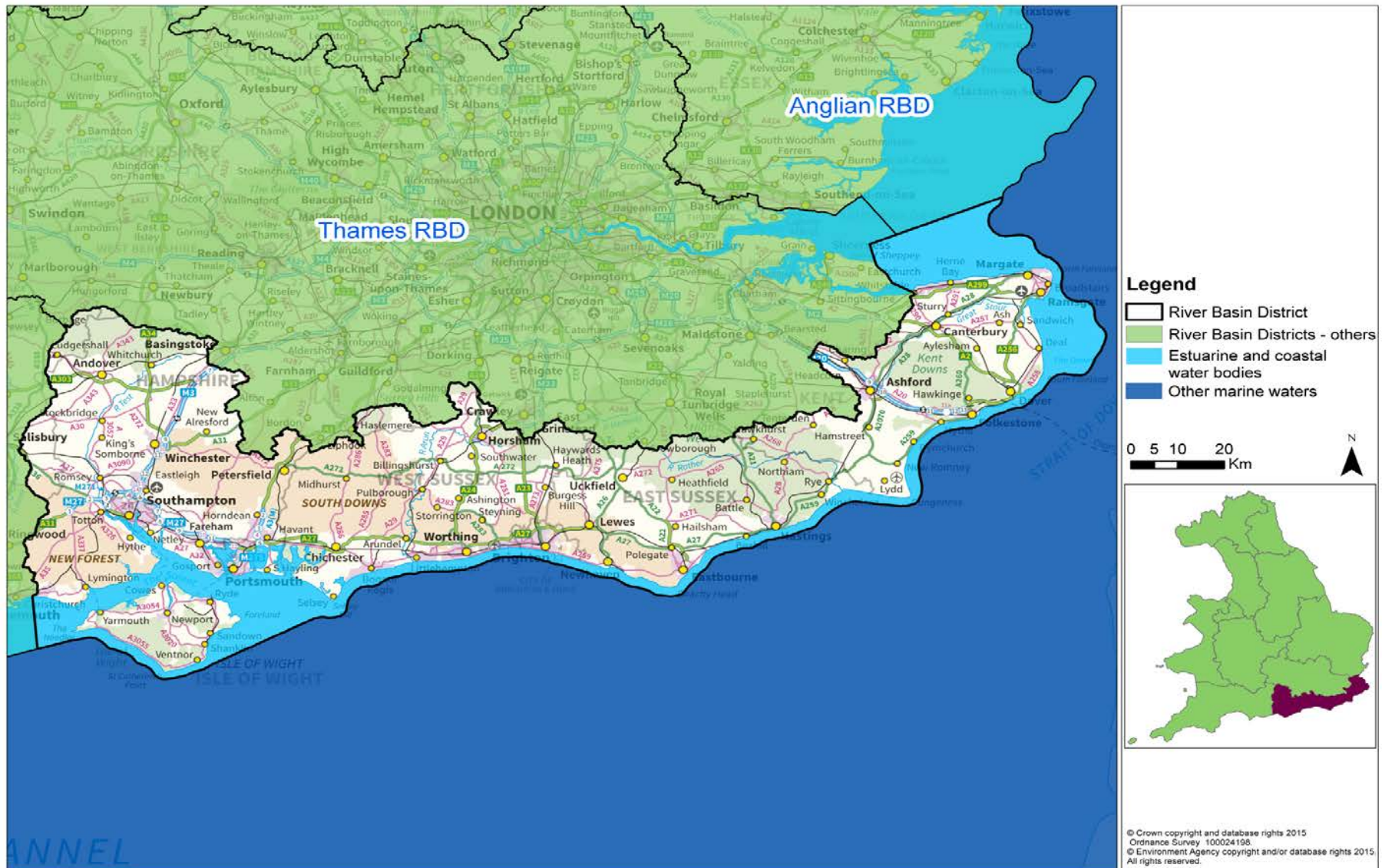
Figure 1: Map of the South East river basin district