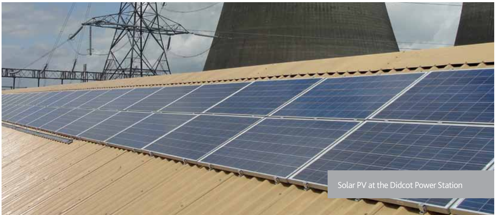
Solar PV at the Didcot Power Station