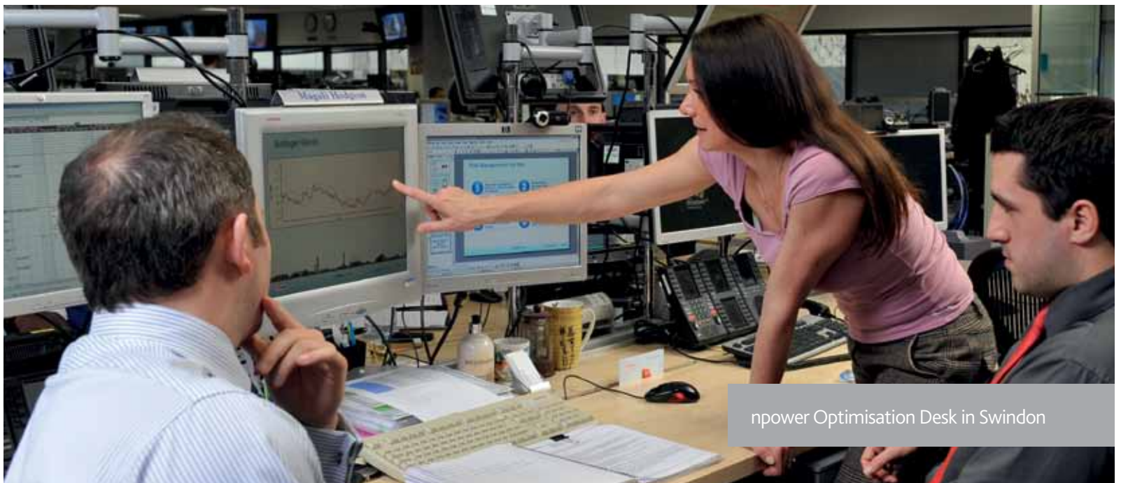
npower Optimisation Desk in Swindon