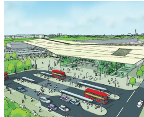
A visualisation of the new station at Old Oak Common

We're extremely aware of the issues that building a new railway presents to those who live nearby, and we take our responsibility to you very seriously. Ultimately, we want to make HS2 mean something positive to everyone, whether it stands for fairness and clarity, better training for current and future engineers, a catalyst for jobs and investment in your area, a world-class railway or simply a new and exciting way to travel.