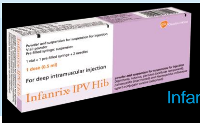
Infanrix IPV Hib