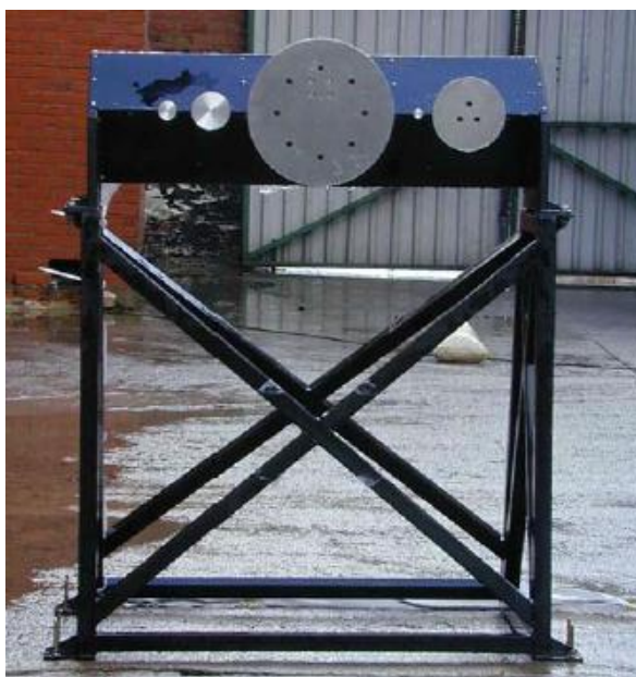
Figure 5. The force plate rig used in the 2004 testing of the PSNI water cannon. The force plates are the five circular elements located in a horizontal array at the top of the rig.

In the 2003/4 tests by Dstl, a custom-designed force plate rig was used (Figure 5):