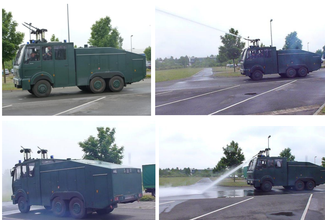
Figure 3. The Ziegler 2628 WaWe 9 water cannon during its initial review in July 2013.

Images of the Ziegler 2628 reviewed by CAST in July are shown in Figure 3: