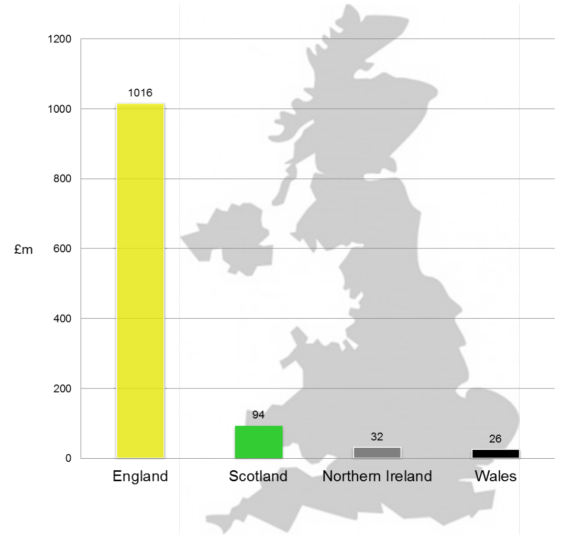
Figure 4: Cumulative outcomes of the NFI identified across the UK (1996 – 2014) £1.17 billion