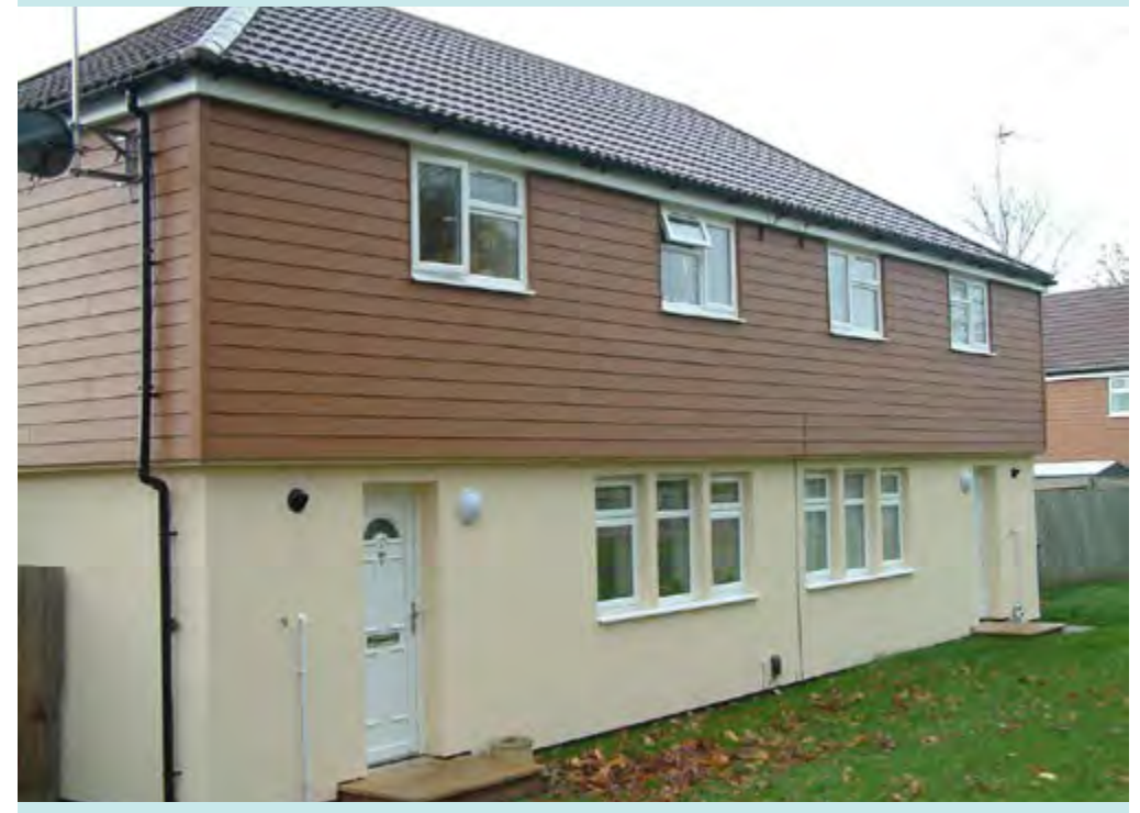
Sgt Bennett's refurbished property

It is an improvement on our last one. As well as being much warmer and cosier, the damp and mould issues are now a thing of the past. And because it is newer with neutral decoration, it is easier to maintain and look after. Plus we've also been able to put our stamp on it and make it our own. We take more pride in the appearance of our new property and as a consequence it feels more like 'home'. The property heats up more quickly than our last property and it stays warmer for longer. We haven't noticed any reduction in the amount of energy that we use so far as we haven't been in for very long and we've had some lovely warm weather, but I'm sure we'll notice a difference as winter draws in. Another thing we've noticed is that there is very little noise from traffic."