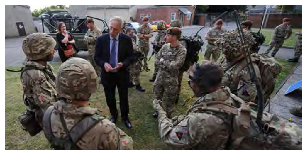
Minister for Reserves, Julian Brazier meets reservists during visit to The Royal Wessex Yeomanry

our web-based portal for Reservists who feel they have been disadvantaged when seeking employment.