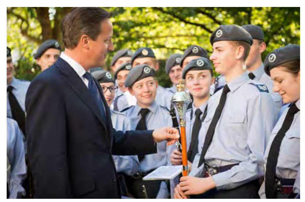
Members of the National Marching band of the Air Cadet Organisation at the No 10 event, on 18 June 2014

The Cadet Expansion Programme (CEP) is making significant progress following the Prime Minister's and Deputy Prime Minister's announcement in June 2012, that 100 new cadet units would be established in state-funded schools in England by September 2015. This programme is on track, with 61 new units established and over 100 more in the pipeline. To financially assist schools who join the programme, the Cadet Bursary Scheme has been established to provide financial assistance in these state schools. This was spear-headed by a Department for Education led fundraising event on 18 June 2014, at Number 10 Downing Street, which was supported by members of the Cadet Forces, where it was announced that £1M of LIBOR funding had been allocated to the scheme.