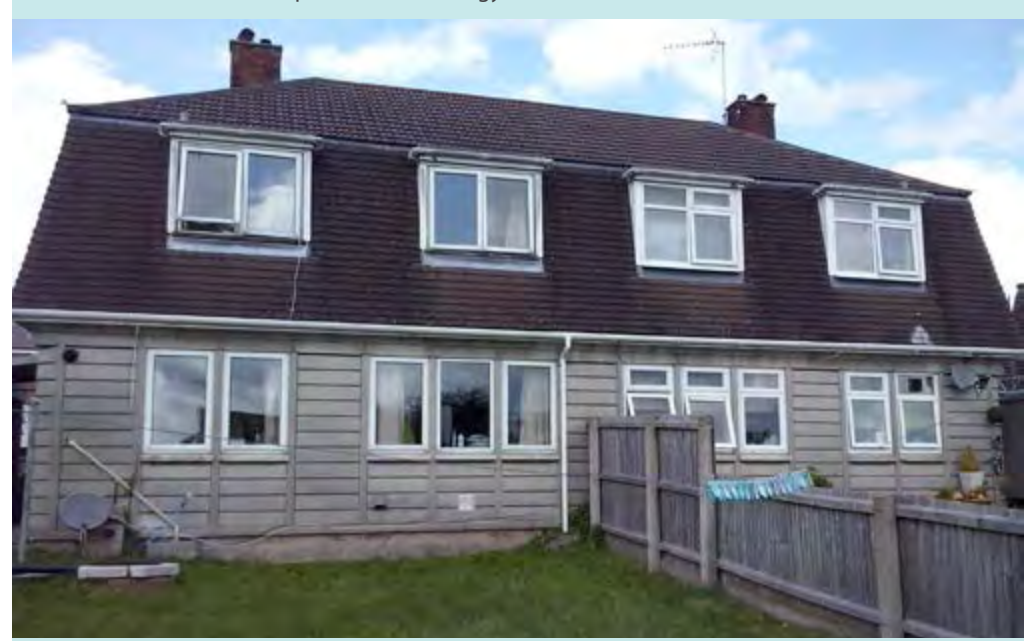
A similar unrefurbished property on the same estate

August 2014. The new property is one of 62 being improved in the estate, and is part of DIO's Mould Action Plan. In financial year 2013/14 this programme targeted 1,063 properties that had a history of damp and mould, and is targeting a further 1,700 in 2014/15. The plan was established to address the issue which is seen as the prevalent maintenance concern of Service personnel and their families. The programme also aims to improve energy efficiency, and therefore comfort and expenditure on energy, for families.