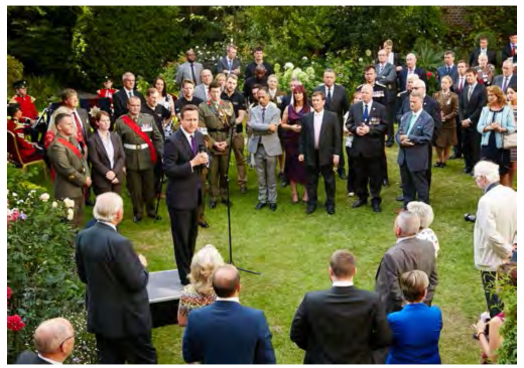
The Prime Minister speaking at the Armed Forces Covenant Celebration on 17 July 2014

Looking to the future, the MOD is considering how the new annual £10M fund can be managed to best support the commitments of the covenant. The intention is to put in place a sustainable solution that can support the commitments of the covenant in the longer term. The Covenant Reference Group is also discussing future priorities for the fund.