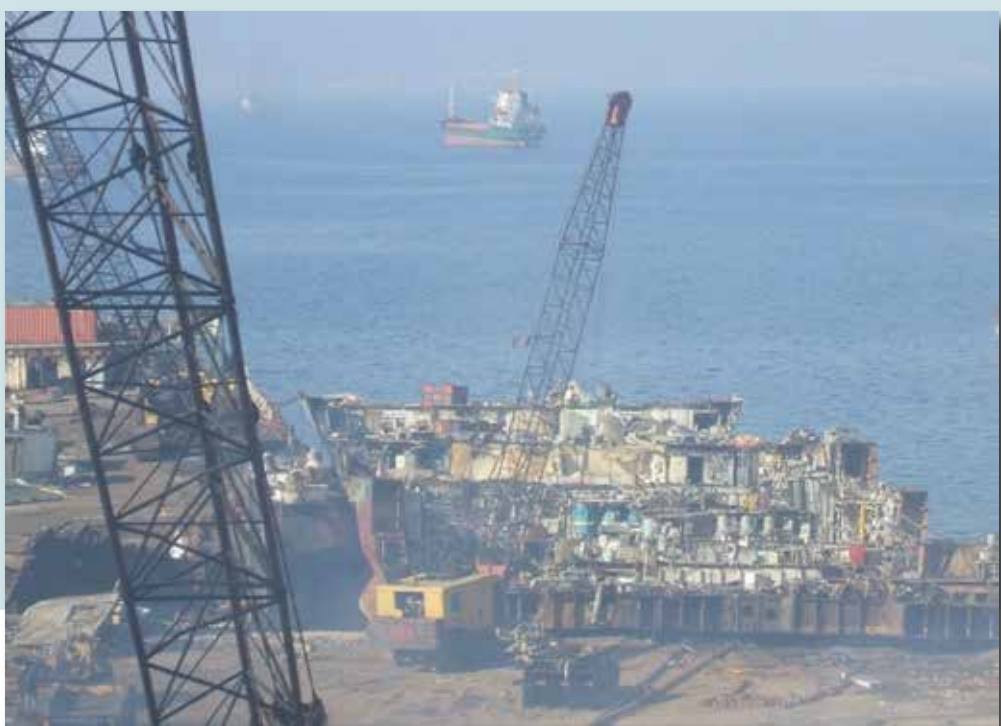
Progress of works 30 October 2013 Superstructure dismantling complete