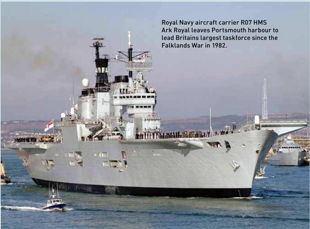
Royal Navy aircraft carrier R07 HMS Ark Royal leaves Portsmouth harbour to lead Britains largest taskforce since the Falklands War in 1982.

The publication is distributed free of charge and made available to readers outside the MOD, including those in the defence industries. The editor takes care to ensure all material produced is accurate