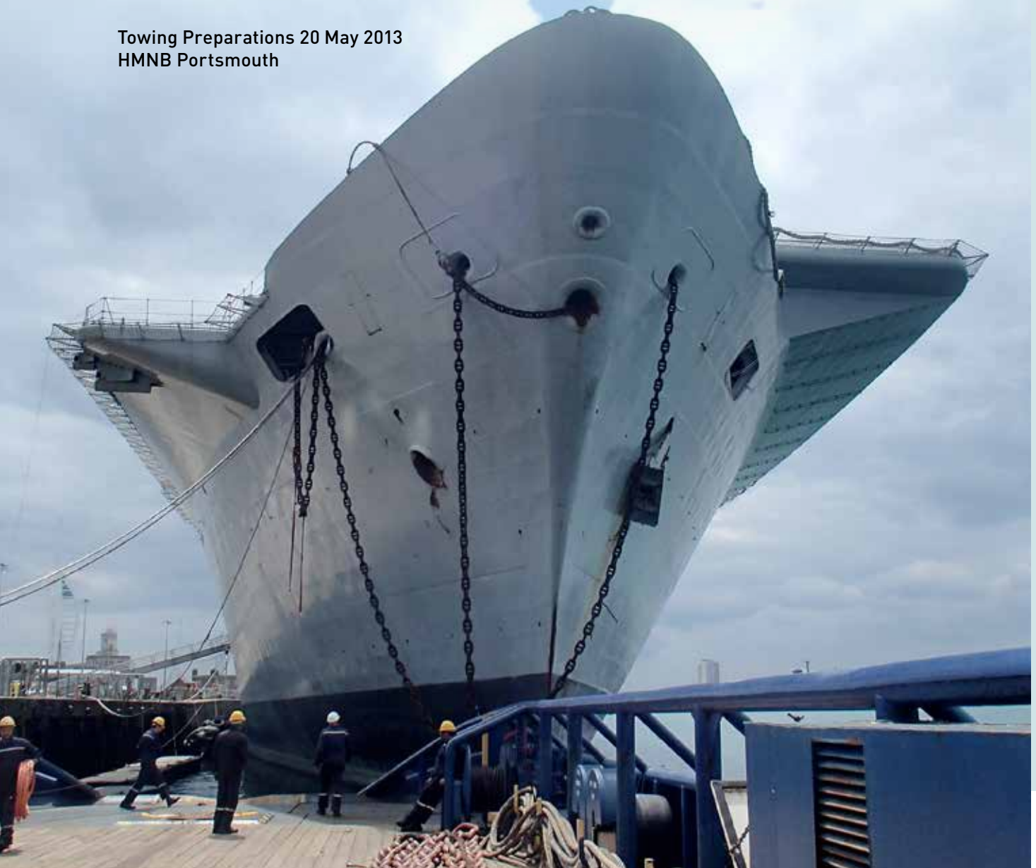
Towing Preparations 20 May 2013 HMNB Portsmouth

In addition to these checks, LEYAL Ship Recycling Ltd was also subjected to audits and inspections from the UK Environmental Agency, ensuring that LEYAL Ship Recycling Ltd were adhering to all current H&S and Environmental Legislation and the terms of their waste management permit.