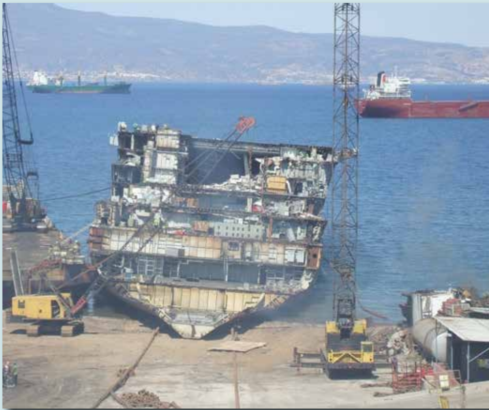
Progress of works 6 September 2013