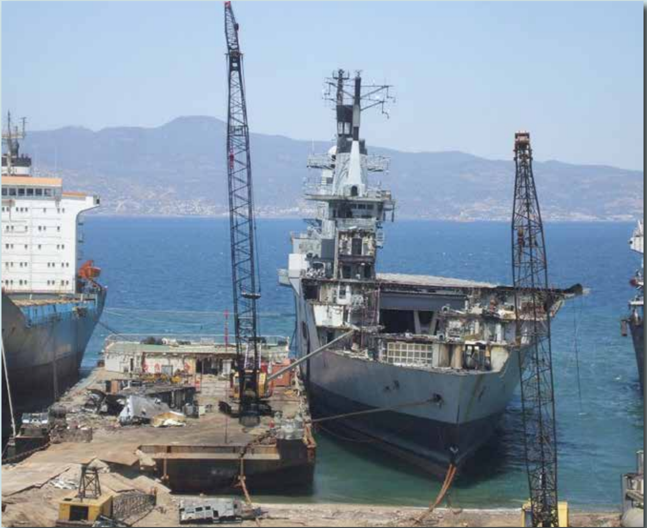
Progress of works 3 July 2013 showing dismantling of superstructure & flight deck

The photographic evidence shows the dismantling progress and this coincides with the Demo Schedule and the sales progress reports supplied by LEYAL on a monthly basis.