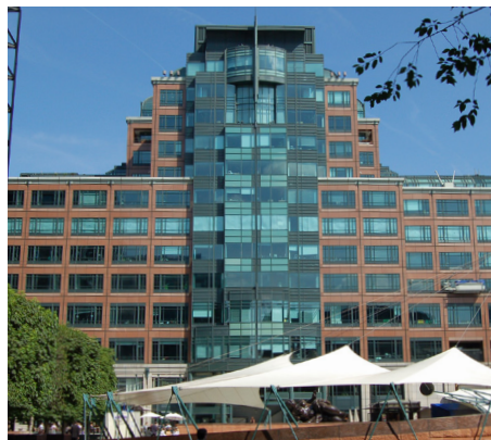
EBRD Headquarters, London

Through donor funds the EBRD mobilise investment capital and expertise by giving local business access to consultant experts. Donor programmes are funded by governments and international institutions, and are managed by the EBRD.