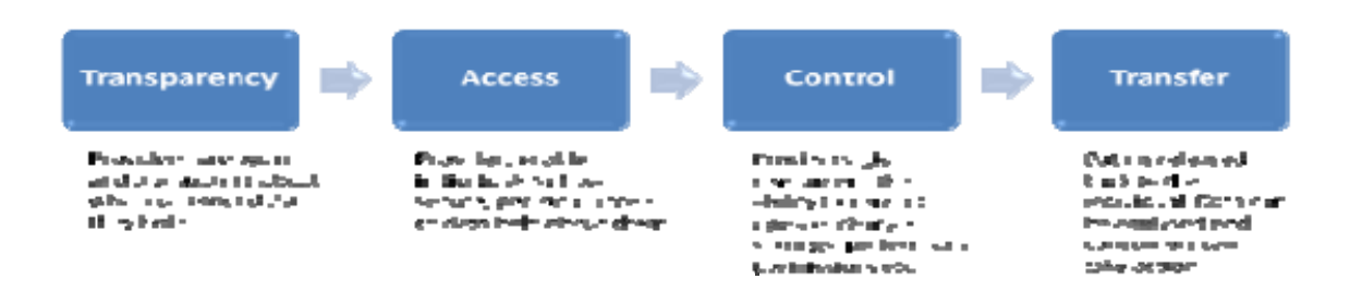
Figure 1 The 'midata' journey

The 'midata' strategy involves a four stage approach (see Figure 1) towards information sharing relationships with customers. These stages are known as TACT (Transparency, Access and Control, data Transfer).