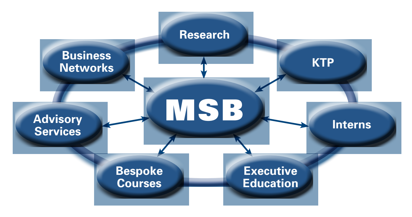
Figure 2: Opportunities for Business School Engagement with MSBs