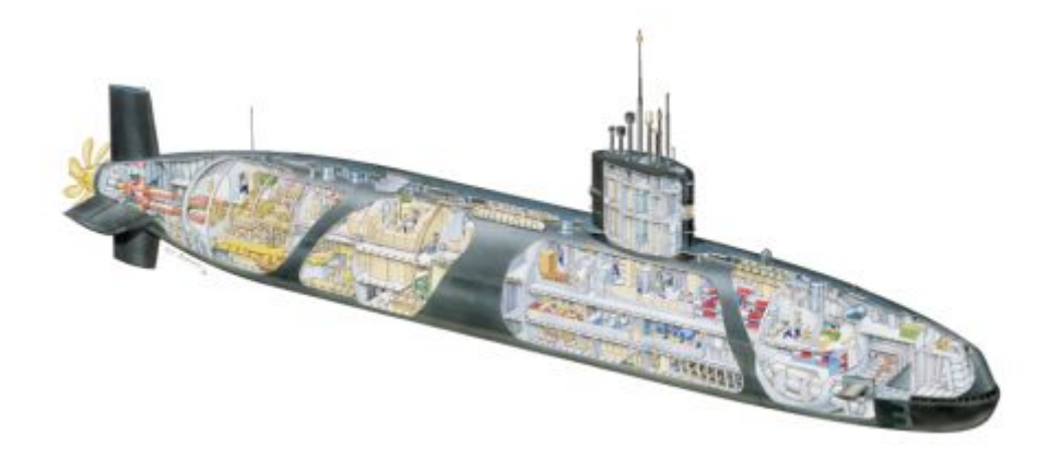
Figure 1 - Cross-Section of a Royal Navy 'T' Class Submarine, showing the location of the Reactor Compartment. (Crown Copyright - Navy News).

Devonport. Until 2004, submarines were also defueled at Rosyth in Scotland, and seven submarines remain there in long-term afloat storage. The majority of the radioactivity remaining in the defueled submarines is contained within the Reactor Pressure Vessel (RPV), the metal container which houses the reactor. This radioactivity is mainly the result of activated steel in the RPV. The RPV is contained within the Reactor Compartment (RC) as shown in Figure 1 below. Since it is held behind the same internal safety barriers as when the submarine was operational, it is safe to be stored afloat for a prolonged period.