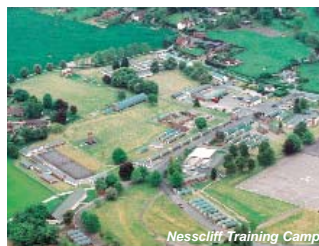
Nesscliff Training Camp

Nesscliff Training Area was originally constructed during the Second World War as an ammunition depot. It continued in operation until the 1960s, after which it became a training area. It is located in Shropshire, between Shrewsbury and Oswestry, one mile west of the A5 (T), and consists of a camp and training area covering 1,717 acres (695 hectares) of MoD freehold land with 18 agricultural tenancies and one Scheduled Ancient Monument. Bordered to the south by the River Severn, the landscape is one of truly English countryside, consisting of grazing meadows, hedgerows, ditches, woodlands and livestock, which makes it suitable for low-level 'dismounted' infantry training for up to two companies. It is also interspersed with old ammunition bunkers (some of which are let to farmers), and an excellent track and road system permitting wheeled vehicle access to all parts. It has hard standing, woods and buildings in which to disperse. This means that the Training Area can be used simultaneously by up to three Royal Signals/Royal Logistic Corps squadrons, or for a complete Field Hospital, Field Ambulance and Field Workshops exercise. It is also used for TA and cadet camps