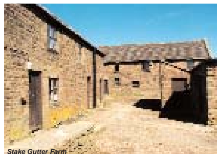
Stake Gutter Farm

Each Training Area is run by a Commandant, supported by Landmarc Support Services, the service provider and strategic partner. Every effort is made to minimise the impact of military training on people's lives. Training area Commandants regularly attend parish council meetings and are the point of contact on local civilian issues.