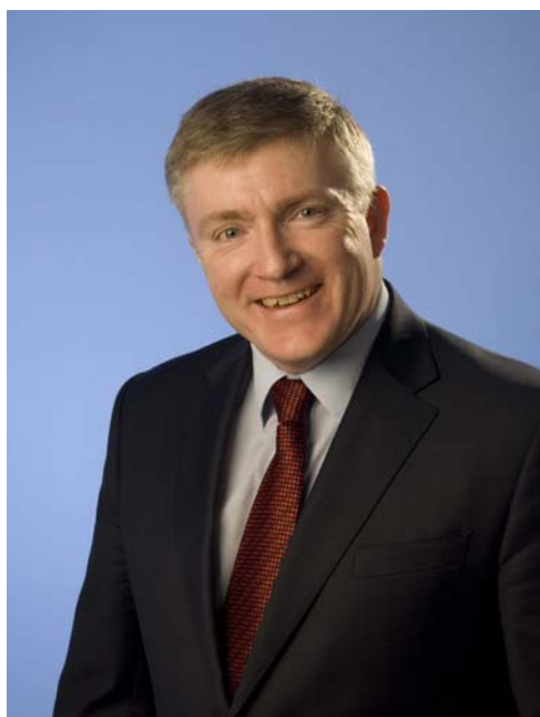
Mark Prisk MP

The response presented here is a starting point, setting out the where we want to go and how we intend to get there. We will continue to build on the strength of co-operation exemplified by the IGT and work in partnership with industry to realise the opportunities of low carbon construction.