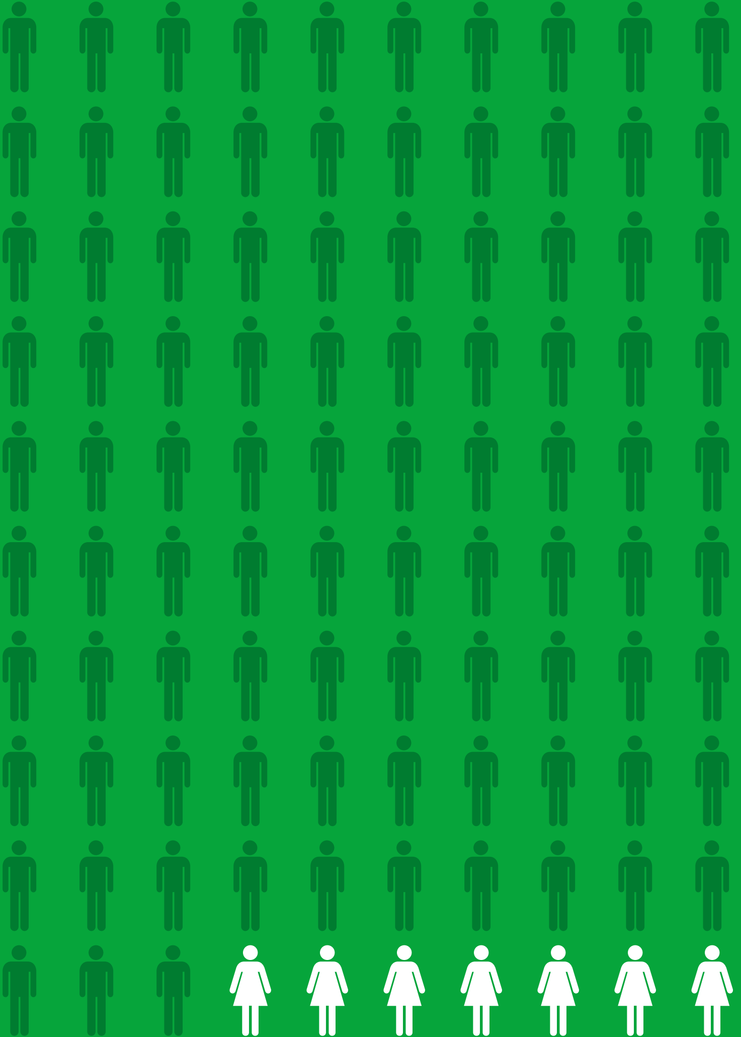
FTSE 100 executive directorships, 93.4% men. 6.6% women.