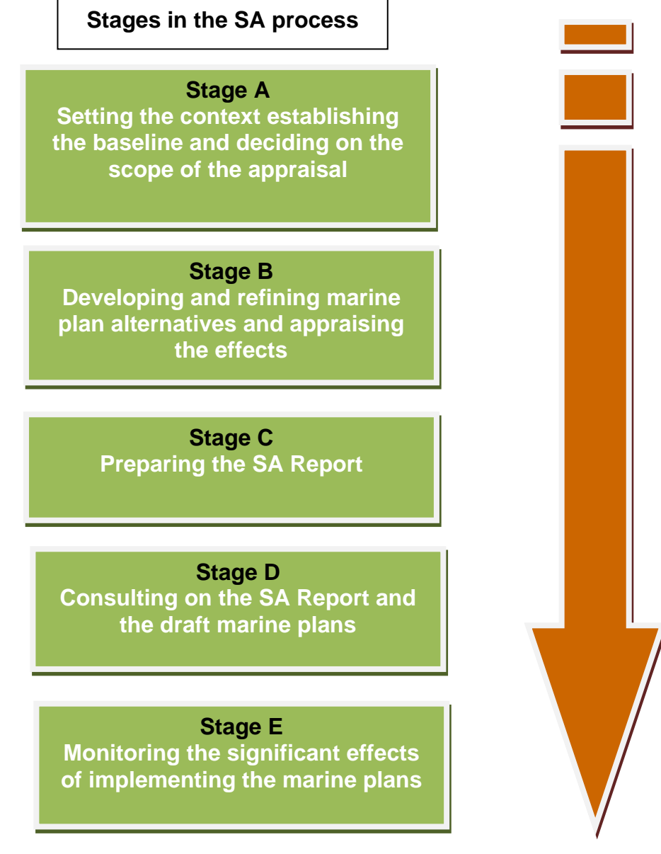
Figure 3.1: Stages in the SA process

The stages in the SA process have been developed to take into account the five procedural stages (A to E) of SEA outlined in the Practical Guide<sup>3</sup>. These are presented in the flow chart below.