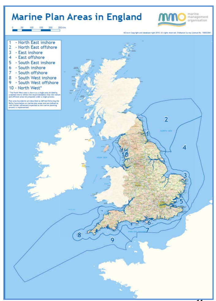
Figure 1.1: Marine plan areas for England<sup>11</sup>

The completed set of plans will create a management system covering the whole English area, integrated with terrestrial plans and, where possible, any existing marine plans for bordering countries.