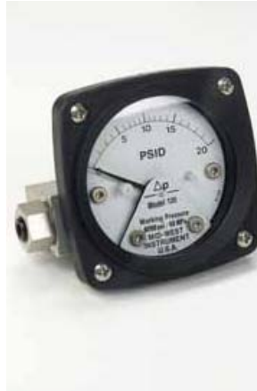
Differential pressure gauge