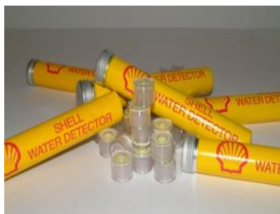
A Syringe and Capsule Water Detector

Testing for dissolved water should be carried out by using a capsule water detector, which changes colour in the presence of water. Suspended water in Jet A-1 fuel at low concentrations will not normally be detectable by eye. See below.