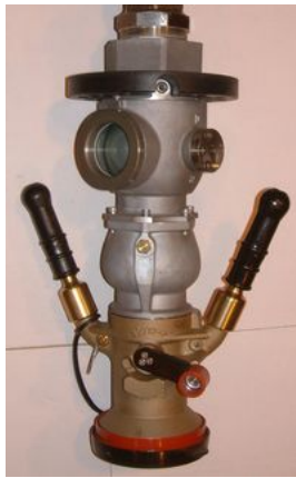
An example of a pressure refuelling nozzle