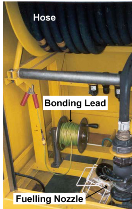
Example of a delivery system

The aim of the delivery system is to transfer fuel from the storage tank to the nozzle, whilst eliminating any contaminants and water. The components of the delivery system can be seen in the diagram of a simple fuel system. The component parts are described in more detail below.