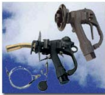
Examples of gravity refuelling nozzles

Both types of nozzle must be provided with dust caps to prevent the ingress of water and dirt. A valve should be provided at the hose-end as an additional precaution in an emergency when using a gravity fuelling nozzle.