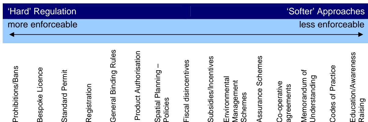
Figure F.1: Types of approaches for mechanisms

These mechanisms are already used to apply many of the so-called 'basic' measures to protect waters and the dependent ecology. These measures have helped achieve greatly improved standards, and represent a considerable amount of activity and investment. They need to continue in order to prevent deterioration.