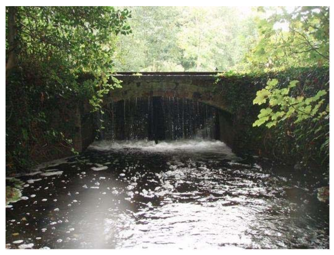
Figure 1.2. Impassable spillway at downstream end of Bayfield Estate lake.