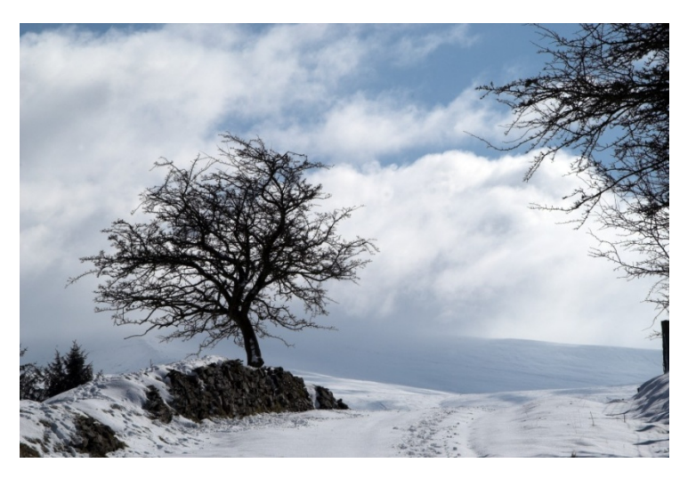
Snow covered road