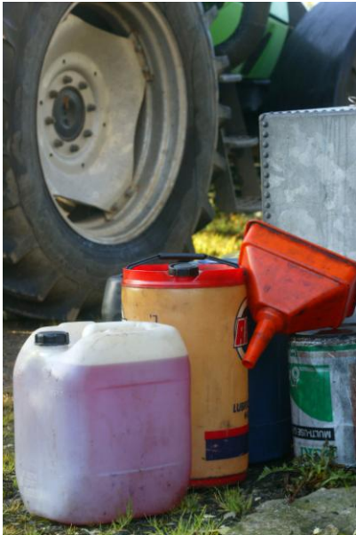
Hazardous farm waste

Manures and slurries are not classed as waste when spread to farmland as a fertiliser. However they can cause pollution and you won't get the best out of them if they are not spread carefully. Refer to the best practice guidance .