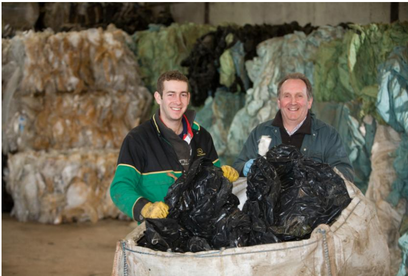
Recycling farm plastics

You do not have to wait until the deadline to register. It's best to act sooner rather than later to ensure you're up to date and fully compliant. To help you register we have produced guidance which includes a table showing you how the old exemptions match the new ones. Some exemptions are almost identical to the old system, some are similar but with different conditions and some are completely new.