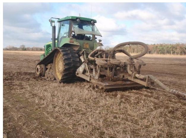
Landspreading by deep injection

Landspreading can beneficially add organic matter to soil and reduce your reliance on manufactured fertilisers and quarried soil conditioners. The new guidance explains whether a landspreading